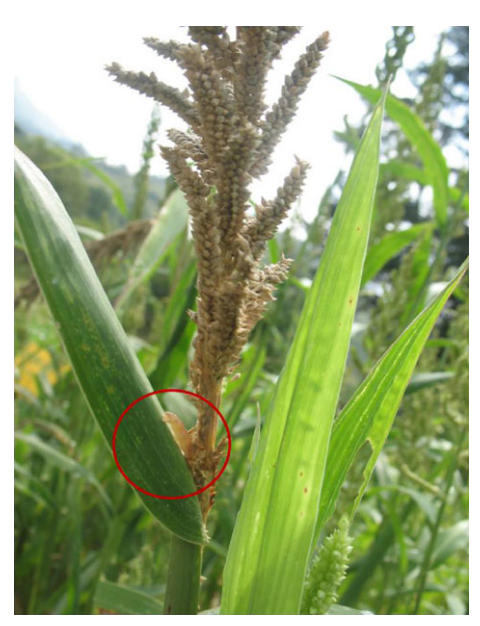
Fig. 4: Stem borer and its damage in barnyard millet

Barnyard millet grain requires dehulling prior to making it suitable for human consumption (Lohani et al. 2012). The dehulling is conventionally performed by repeated pounding in mortar, which is time consuming and also labour intensive as the grains