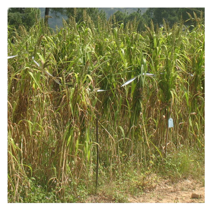
Fig. 2: Barnyard crop trial at VPKAS, ICAR, Almora, Uttarakhand, India

The flowering starts from top of the inflorescence and moves downward completing in 10-15 days. Flowers open from 5 to 10 am with maximum number of flower opens between 6 and 7 am (Sundararaj and Thulasidas 1976, Jayaraman et al. 1997). In the individual raceme, the flowering first starts at marginal ends and then proceeds to the middle of the raceme. The flowers are hermaphrodite (have both male and female organs). Before the anthers dehiscence, the stigmatic branches spread and flower opens (Seetharam et al. 2003). Late season florets are cleistogamous (not opening) (Maun and Barrett 1986). It is primarily self-pollinating (Maun and Barrett 1986, Potvin 1986, 1991) and self-compatible (Maun and Barrett 1986). Some degree of outcrossing recorded which was facilitated by wind pollination (Maun and Barrett 1986). Hot water treatment of inflorescence at 48°C for 4-5 min (personal observation) was effective in inducing male sterility under hill condition in both the cultivated species.