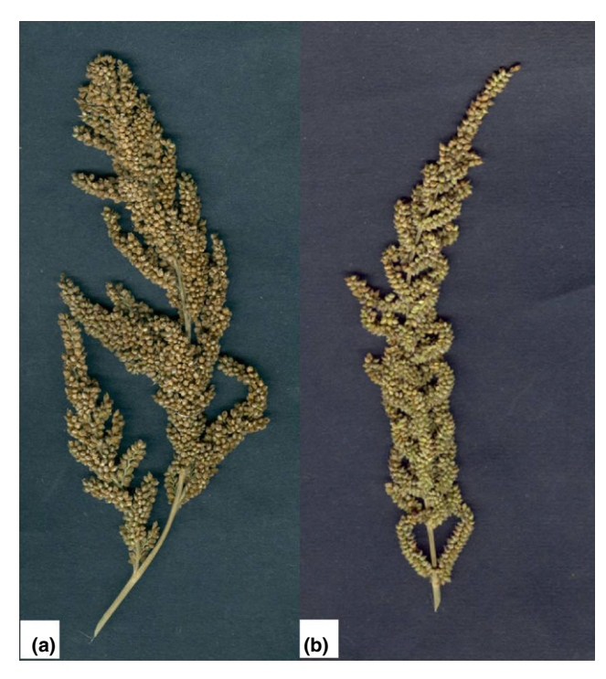
Fig. 1: Panicles of two cultivated species of barnyard millet (a) Echinochloa esculenta (b) Echinochloa frumentacea

branching, more compact growth habit, larger inflorescence, reduced shattering and larger seed size. Yabuno (1975) considered low seed shattering, lack of seed dormancy, thick culms, wide leaves and round spikelets in E. esculenta were the main characters selected by man during the process of domestication. This suite of traits that constitutes 'domestication syndrome' for closely related foxtail millet (Defelice 2002, Doust et al. 2005, Li and Brutnell 2011) and pearl millet (Poncet et al. 1998, 2000) is likely for barnyard millet as well. Increase in seed size in Japanese barnyard millet during domestication is suggested by archaeological data. The mean size of Echinochloa caryopses from the Middle Jomon period (3470 B.C.E.-2420 B.C.E.) was about 20% larger than specimens from Early Jomon period (5000 B.C.E-3470 B.C.E), indicating that selection for larger seed size was taking place over several millennia in Northern Japan (Crawford 1983, 2011, Takase 2009). The cross-compatibility between domesticated barnyard millet and their ancestral forms and the existence of naturally occurring intergrades between the two forms provide avenues to understand the mechanisms driving domestication and elucidate the genetics of domestication traits in this crop.