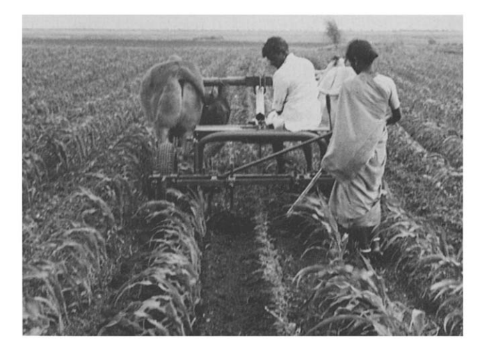
Fig. 1. An animal-drawn wheeled tool carrier (WTC) in use for interrow weeding.

In order to obtain precision and timeliness for farm operations, a wheeled tool carrier (WTC) based animal-drawn farm machinery was developed. The WTC (Fig. 1) described in detail elsewhere (Bansal and Srivastava, 1981; Bansal and Thierstein, 1982) can perform various field operations by attaching appropriate implements to a toolbar at the rear of the machine. The WTC, usually pulled by a pair of oxen, provides flexibility for making suitable ad-