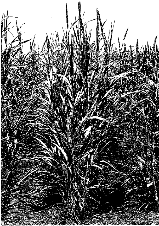
Fig. 1. Sweet-stalk pearl millet with profuse nodal tillering, long narrow leaves and small spikes.