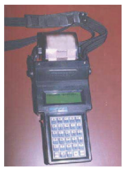
Figure 1: Spot Billing Machine

6.18 The service allows citizens to pay their electricity dues. Each kiosk is equipped with