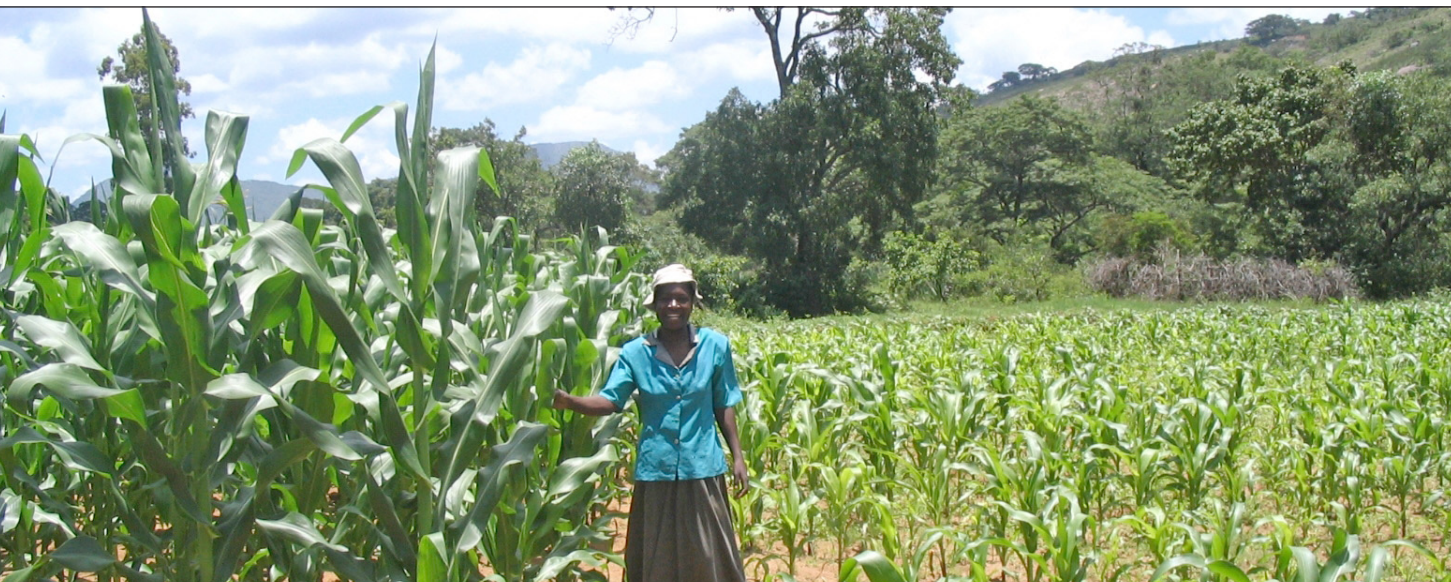
The benefits of conservation agriculture are hugely evident when compared to untreated plots.

not only during the cropping season, but also in the off-season (when family members are away, working in the towns). The project partners believe the problem can be solved – and so do farmers and community leaders who have seen the results – results from more than 300,000 households in Zimbabwe that speaks volumes about the success.