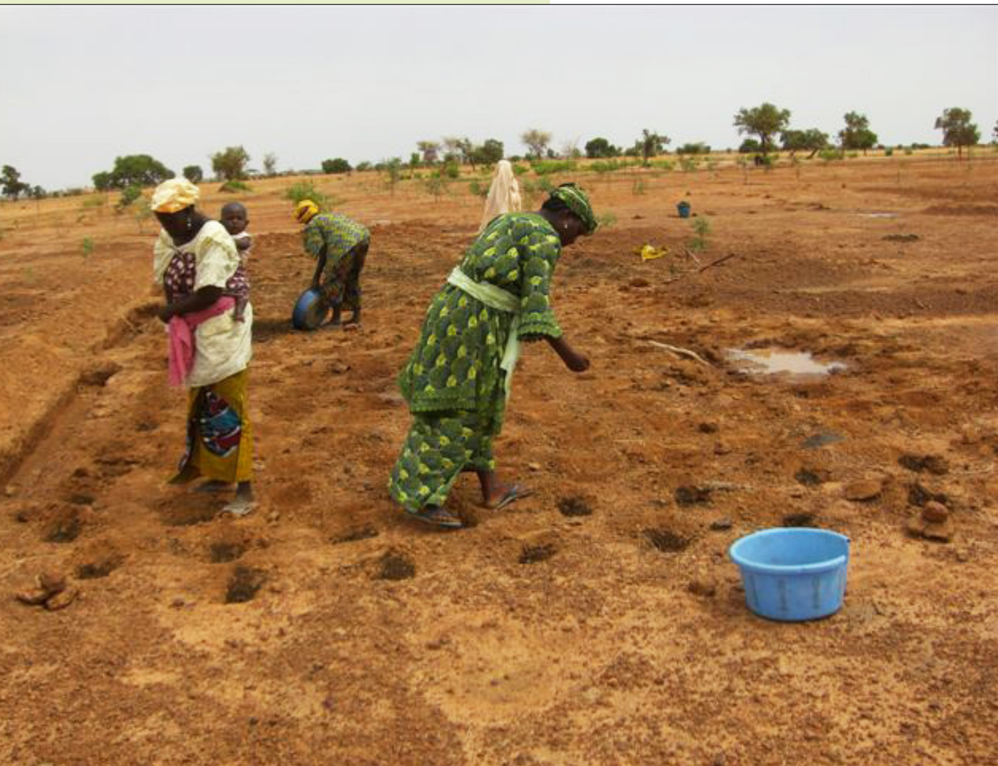
Women preparing the zai pits before the rains.

The principle is straightforward: rather than spreading nutrients and water uniformly over the