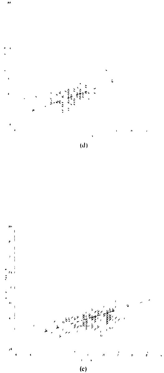
Fig 1 a Relationship between total dry matter yield ( \text{kg ha}^{-1} ) and grain yield ( \text{kg ha}^{-1} ) of pearl millet genotypes. y = 84 + 0.380 \times (R^2 = 0.67^{**}, \text{df} = 190) b Relationship between grain yield ( \text{kg ha}^{-1} ) and harvest index (HI %) of pearl millet genotypes y = 472 + 60.10 \times (R^2 = 0.28^{**}, \text{df} = 190) c Relationship between phosphorus use efficiency (PUE) and harvest index (HI) of pearl millet genotypes. y = 8.64 + 0.162 \times (R^2 = 0.48^{**}, \text{df} = 190) d. Relationship between harvest index (HI) and nitrogen translocation index (NTI) of pearl millet genotypes. y = 1.41 + 0.589 \times (R^2 = 0.44^*, \text{df} = 190) e Relationship between harvest index (HI) and phosphorus translocation index (PTI) of pearl millet genotypes y = 7.86 + 0.478 \times (R^2 = 0.38^{**}, \text{df} = 190) .