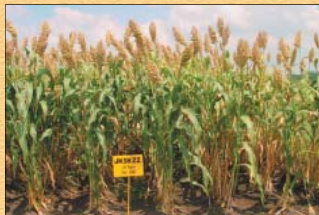
JKSH 22 is popular with farmers for cultivation in the rainy season.