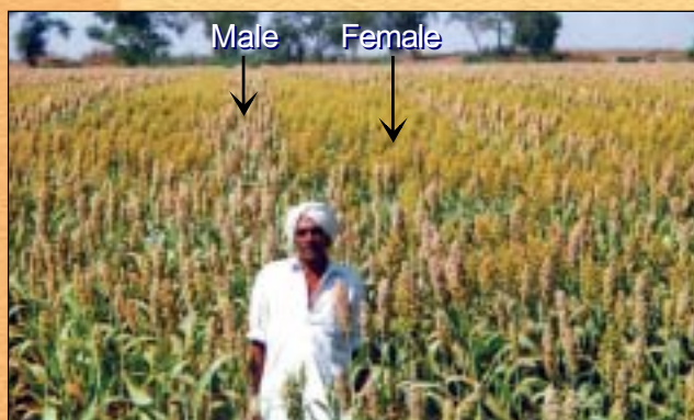
JKSH 22 on a farmer's field: the taller, white, early-maturing rows are male, and the shorter, green and late-maturing rows are female.

The base parental lines received from ICRISAT in early 1990s were further modified, selected and multiplied. Several hybrids made from the modified ICRISAT-supplied hybrid parental lines were field tested in multi location trials. Also, several on-farm demonstration trials were conducted involving the selected hybrids. Based on the performance and feedback of the farmers, JKSH 22 (JKSH 161) was finally selected for large-scale production in 1994 and marketing in 1995. It was also tested in the All India Coordinated Sorghum Improvement Project and was released for all agro-climatic zones in India in 1999.