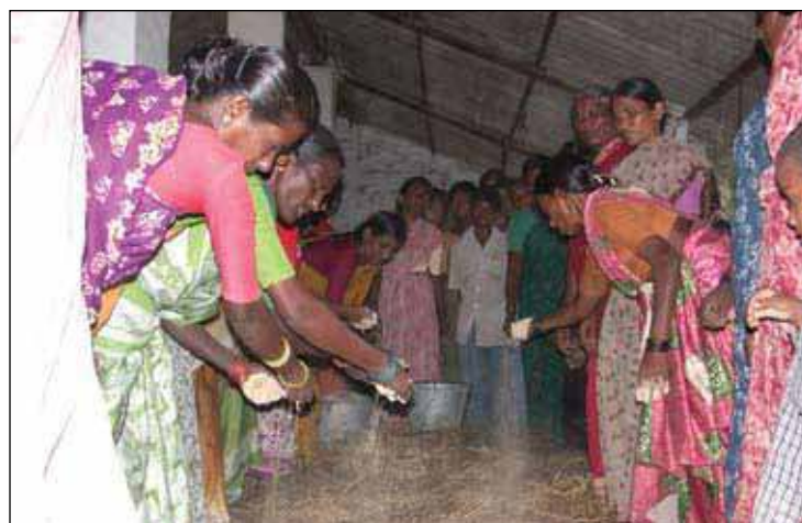
Figure 6. Vermicomposting by women SHGs in Mentapally, Mahbubnagar.

Vermiculture: Vermiculture became a prominent micro-enterprise for rural landless and women groups, as it requires low investment. Vermiculture is environment friendly as it converts disposal of organic wastes generated in farms as well as in household front as productive plant nutrient. These residues contain valuable plant nutrient and can be effectively used for increasing the agricultural productivity. Earthworms convert the residues into valuable source of plant nutrients by feeding on the organic material and excreting out valuable organic manure. Earthworms are one of the major soil macro-invertebrates. The role of earthworms in the soil is to improve soil fertility and soil health. Vermicompost increases water-holding capacity of the soil, promotes crop growth, helps produce more, and improves food and fodder quality (Nagavallema et al. 2004).