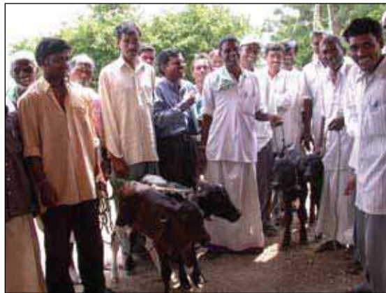
Figure 4. Upgrading livestock.

Upgrading and Rearing Livestock: watershed program is an important intervention in dryland areas to improve crop as well as livestock productivity. Small ruminants like, sheep or goats are the best source of regular cash income throughout the year for rural poor without much investment. They form a major component in a tree-crop-livestock diversification/integration paradigm. As integrated crop-dairy farming system is a viable and profitable proposition to the farmers, upgrading livestock is essential.