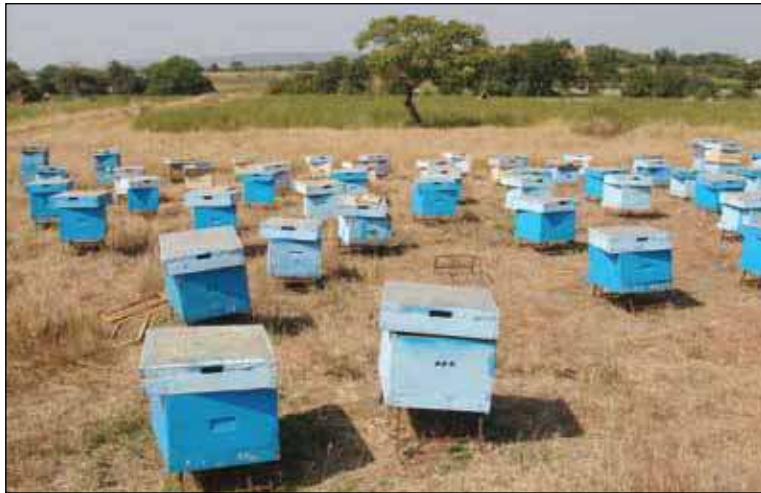
Figure 3. Apiculture.