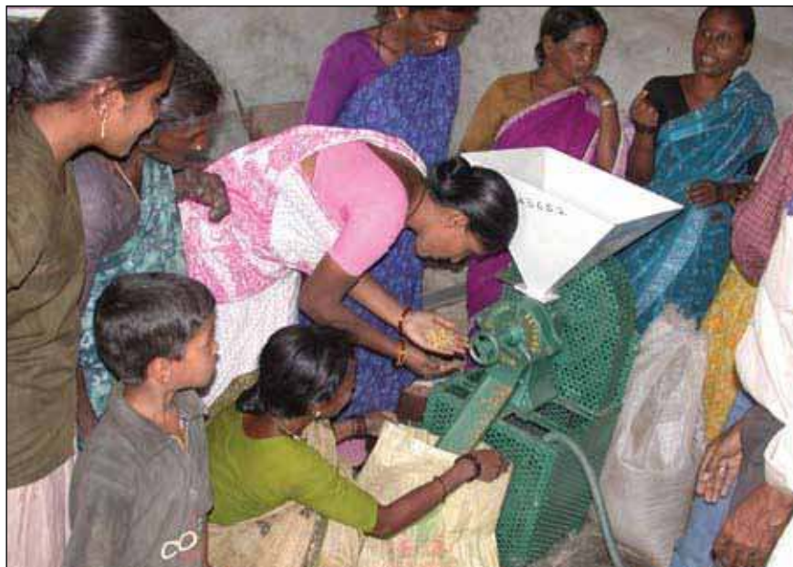
Figure: 7. Low cost dal mill in watershed villages.

Nursery Raising: Nursery raising forms a means of livelihood for large number of people (Figure 8). Nursery raising as the means for developing livelihood and income-generating opportunities for the local communities. It also provides capacity building and skills upgrading for members of the communities. Nursery raising generates cash income, means for poverty alleviation, opportunity for women and aged people to contribute to income generation and flexible working hours.