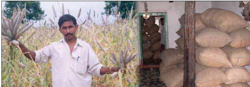
Figure 5. Village seed bank system.

drudgery of seed companies in terms of spurious seeds supply. Therefore, seed banks emerged as a worthy social capital in rural areas.