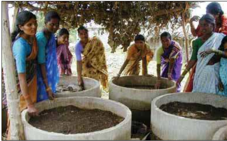
Figure 9. Women involved in vermicomposting activity.