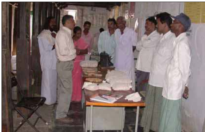
Figure 10. Discussion with project scientists.

Lakshmi Self help group is a thrift group with eleven women members. The group started procuring seeds of improved chickpea varieties (ICCC 37, ICCV 10, ICCV 2 and KAK 2) supplied by ICRISAT under the ADB project from 2000 (Figure 10). The group first identifies the farmers who have sown the improved chickpea varieties. Upon harvest of the crop, the group approaches the identified farmers and offers to buy