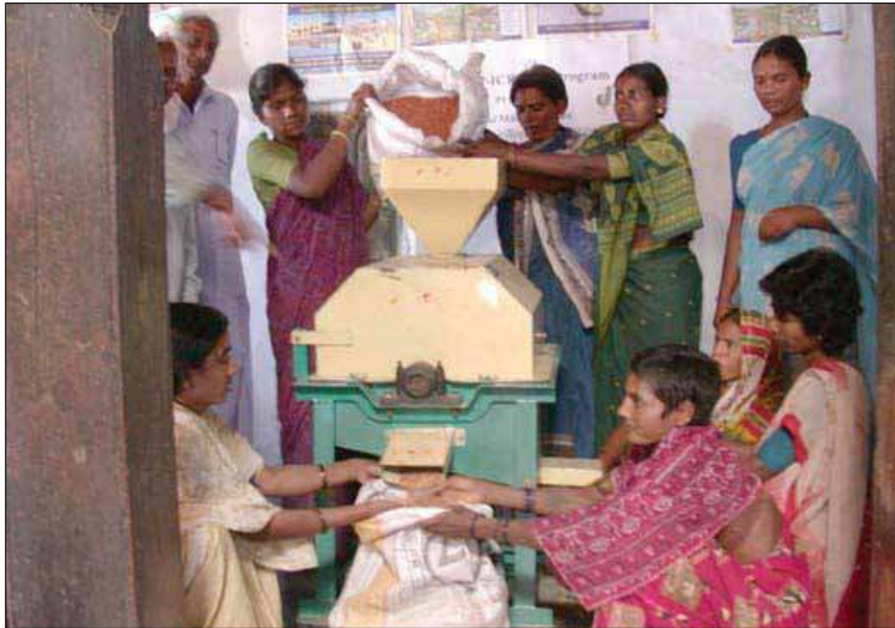
Figure 12. Dal making by women self-help group in Karivemula.

farmers and not the middlemen, dal making proposition was discussed with the PIAs and farmers. Farmers in Mentapally were the first to come forward and formed the SHG and established the dal mill on a pilot basis (Figure. 12). Till now they have converted 600 kg of pigeonpea into dal and added Rs 5400 value to their produce. They have worked out the charges to be paid to the SHG, which are lesser than the commercial mills and have recorded 90% dal recovery. In addition to the value addition, farmers have got the nutrient-rich pigeonpea hulls to be used as animal feed (ICRISAT, 2004).