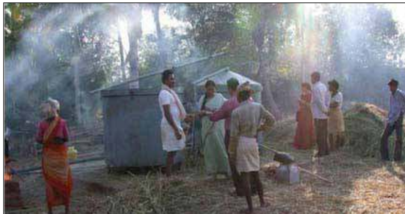
Figure 2. Distillation of lemongrass in Padmatipally, Nalgonda.

Medicinal and Aromatic Plant Extracts: Medicinal and aromatic plants possess the ability to grow in poor soils and under low rainfall and moisture conditions, thereby assisting in the natural regeneration of these crops. These crops improve specialized skills; encourage contacts with niche markets; adds to crop diversification; and provides employment opportunities (Rangarao, 2009). Value addition to medicinal and aromatic plants product is one of the objectives of crop diversification. Processing of aromatic plants by extraction of oil is value addition to lemongrass, palmarosa, vetiver, and Eucalyptus citriodora (Reddy et al. 2008).