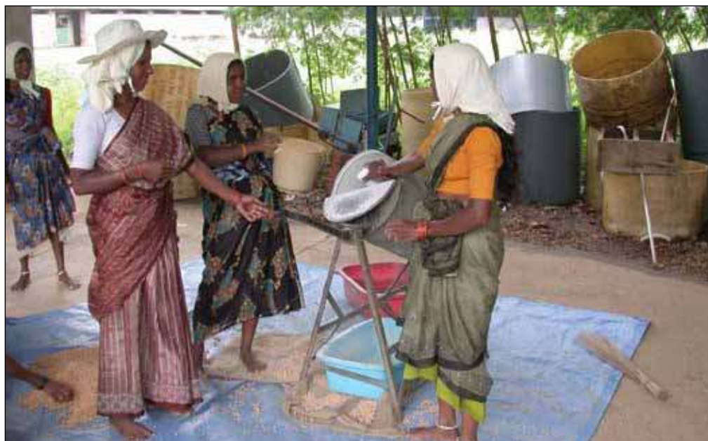
Figure 11. Trained women grade and treat seeds.

The seed reliability, quality and availability at the farmer's doorsteps are the major factors, which are influencing farmers to buy chickpea seeds from the group at a premium price. It is indeed interesting to note the prevailing notion is that the SHG