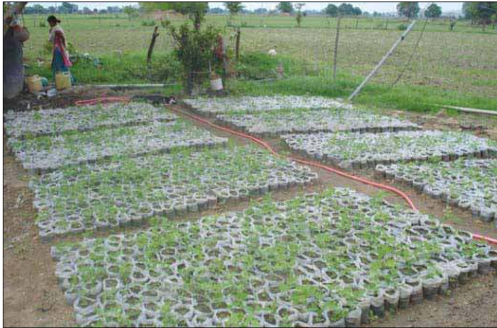
Figure 8: Nursery raising.