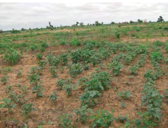
Figure 12. Okra in women's plot. The variety Konni was selected for earliness, yield and quality, yielding around 1 ton/ha fruit.

The BDL is an innovative production system of horticultural crops that provides solutions to a range of critical constraints affecting the livelihood of the rural population of the Sudano Sahel. Because of its simplicity and its many positive attributes the potential for its mass-adoption is very high.