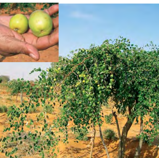
Figure 8. Three year old Pomme du Sahel planted in a demi-lune. Average fruit yield is about 10 kg/plant. Top left-fruit of the variety 'Kaithely' is very tasty and highly nutritious.

Pomme du Sahel has ten times the concentration of Vitamin C as compared with apple. It is rich in iron, calcium and phosphorus and in essential amino acids.