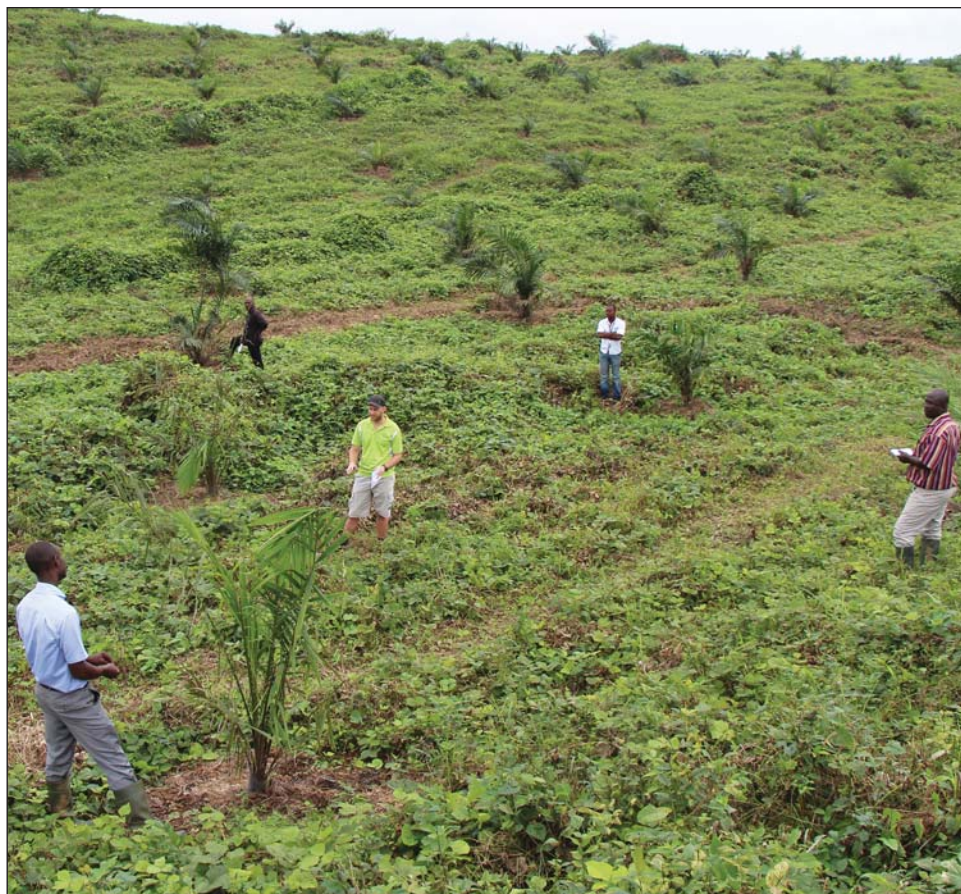
Field evaluations are carried out to pinpoint deficiencies in management practices that contribute to yield gaps. Site-specific best management practices are then developed and proposed as remedial action.

Compared to a previous suitability assessment (van der Vossen, 1969), our methodology shows a larger suitable area (+20%) for oil palm production in Ghana. The difference is likely the result of different methods used to determine suitability, but also because of a changing climate. Meteorological observations show that the climate in the oil palm belt has changed between 1960 and 2000. In particular, temperatures increased and there was less, but more variable rainfall. These climate trends are projected to continue to 2050 (EPA and Ministry of Environment, 2011), suggesting a more favorable water balance and growing