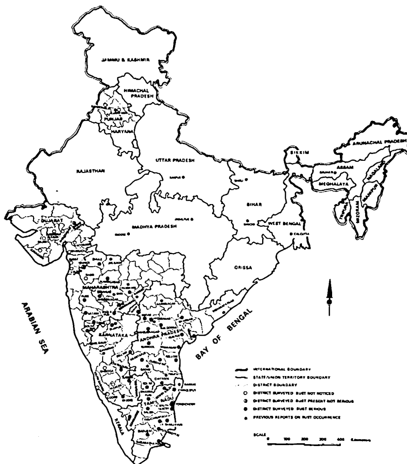
Fig. 1. Distribution map of groundnut rust in India 1976–1978.