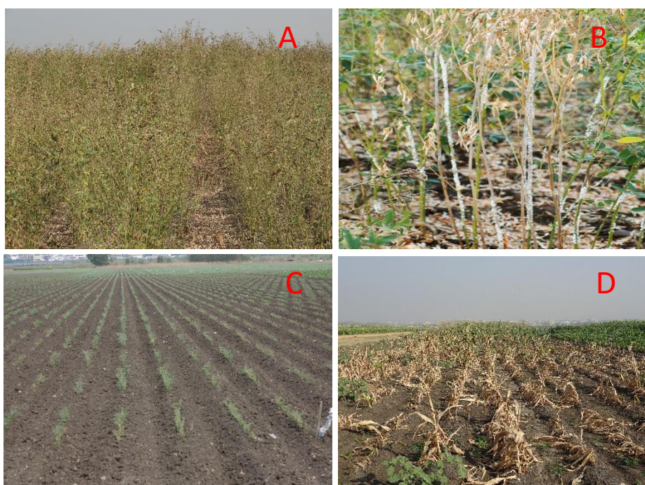
Fig 1. Pest outbreaks due to climate change (a = Pod borer, Helicoverpa armigera damage in pigeonpea following wet weather conditions in Sept – Oct, b = Mealy bug, Ceroplastodes cajaninae infestation in pigeonpea under prolonged hot and dry conditions, c = Beet armyworm, Spodoptera exigua damage in chickpea triggered by winter rains on Oct – Nov, and d = Pink stem borer, Sesamia inferens damage in sorghum due to hot and dry conditions during the postrainy season).