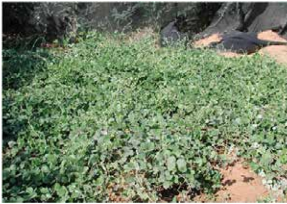
Fig 3 Cajanus albicans , a wild relative and donor of high protein