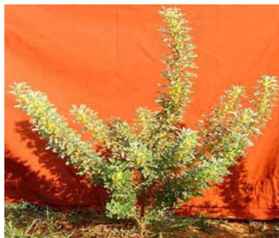
Fig 2 Cajanus sericeus , a wild relative and donor of high protein