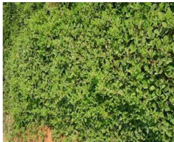
Fig 1. Cajanus scarabaeoides , a wild relative and donor of high protein