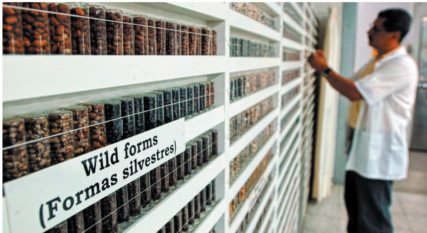
The International Center for Tropical Agriculture in Colombia holds 65,000 crop samples from 141 countries.