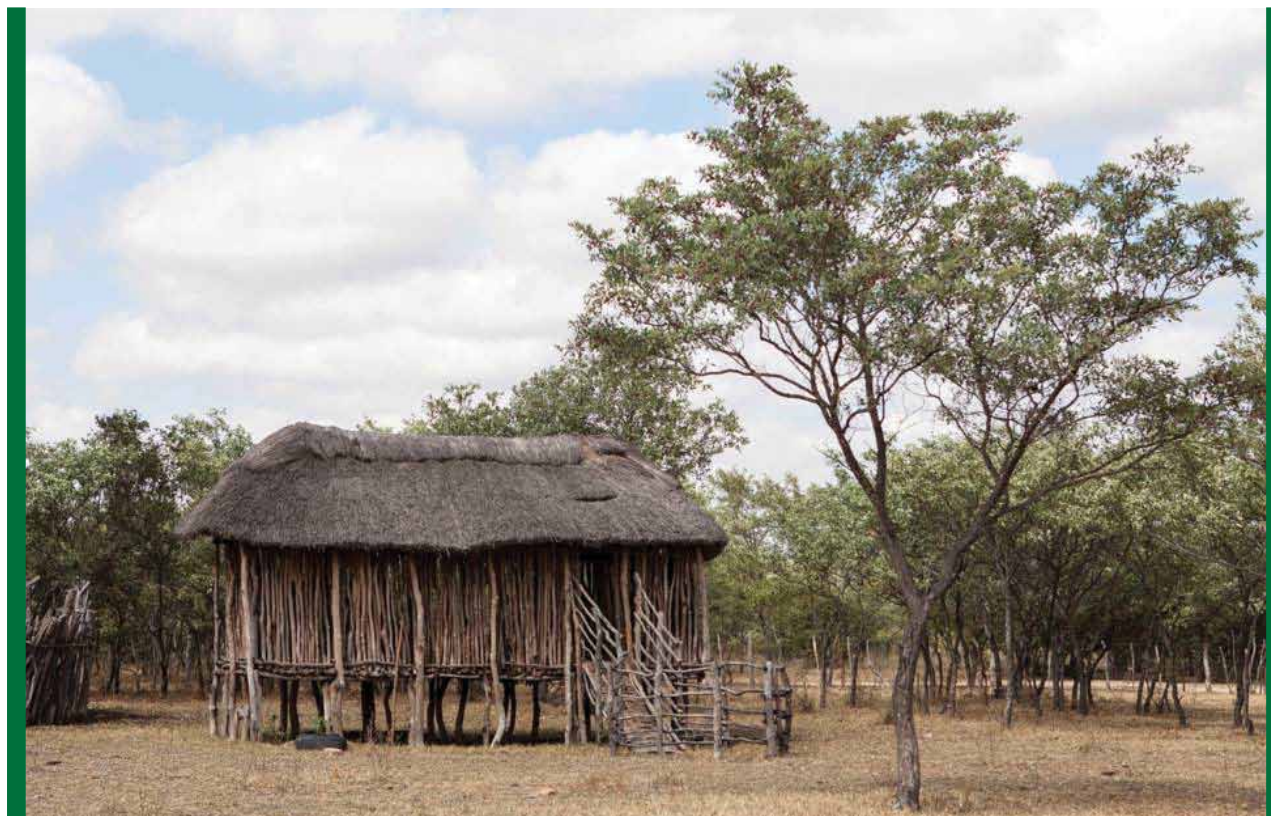
Providing goats with improved housing built with locally available material can help prevent illness and reduce mortality rates.

Strategic investment in infrastructure and investing in the development of more inclusive and sustainable partnerships are also important changes to make to the system so farmers can realize greater benefits from their animals.