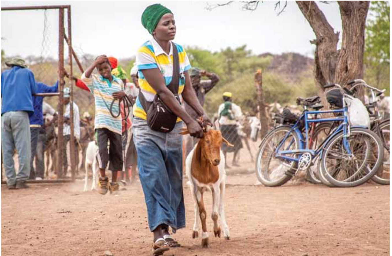
A livestock keeper takes a goat to the market in Zimbabwe.