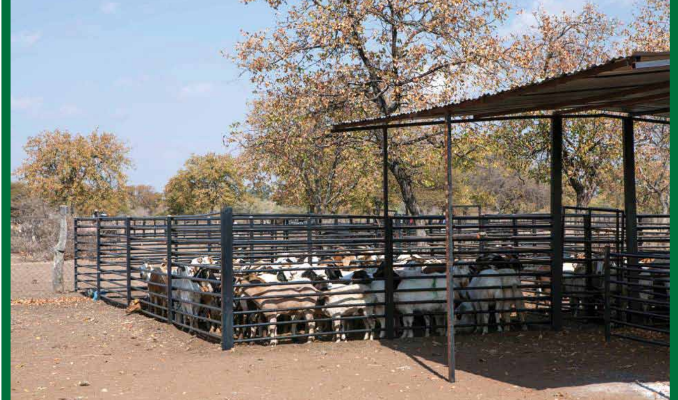
Improved goat sale facilities such as this in Gwanda, Zimbabwe, along with new market institutions have helped to boost goat prices from USD 20 to USD 35-50 per animal.