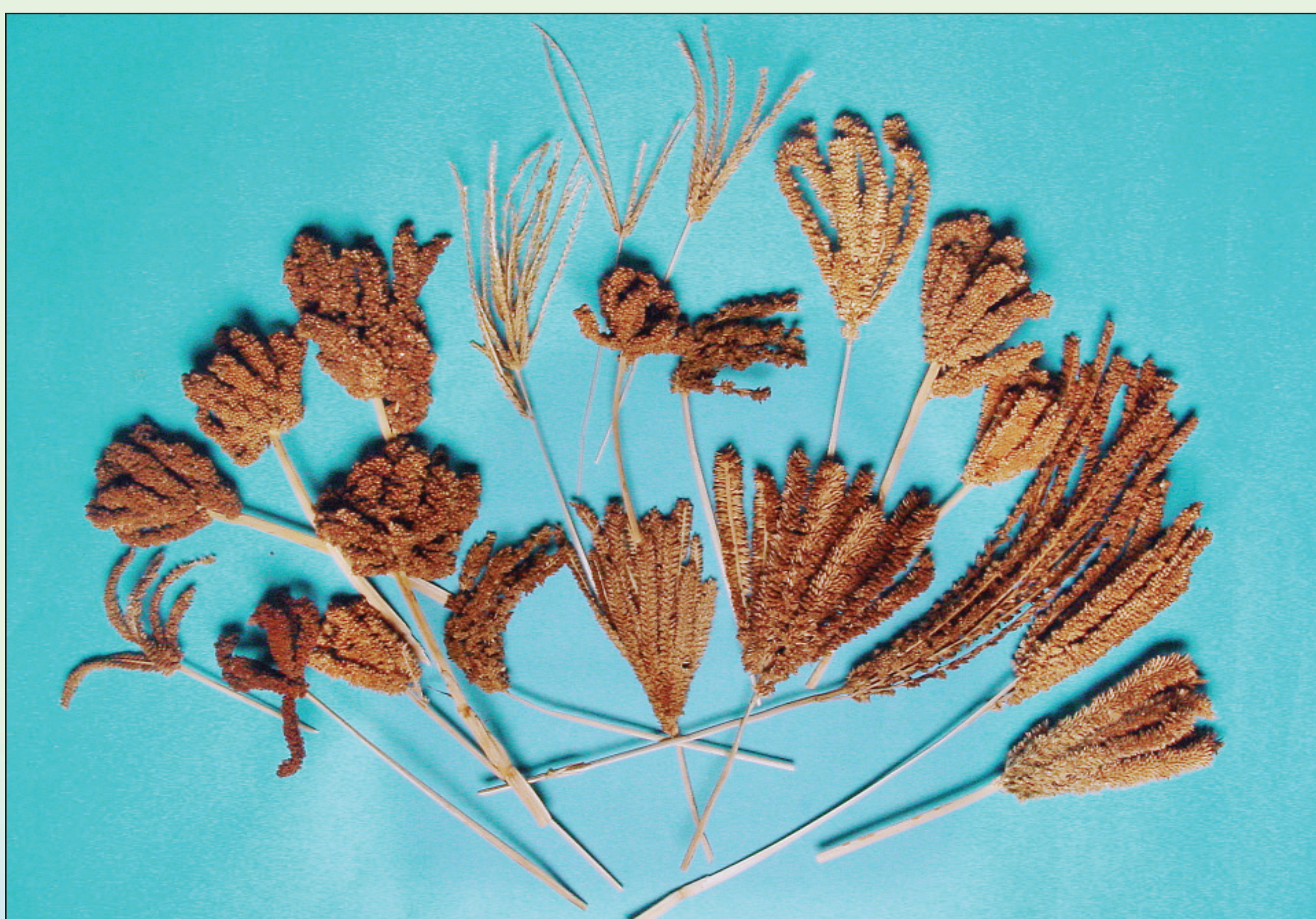
Diversity of spikes in finger millet germplasm.