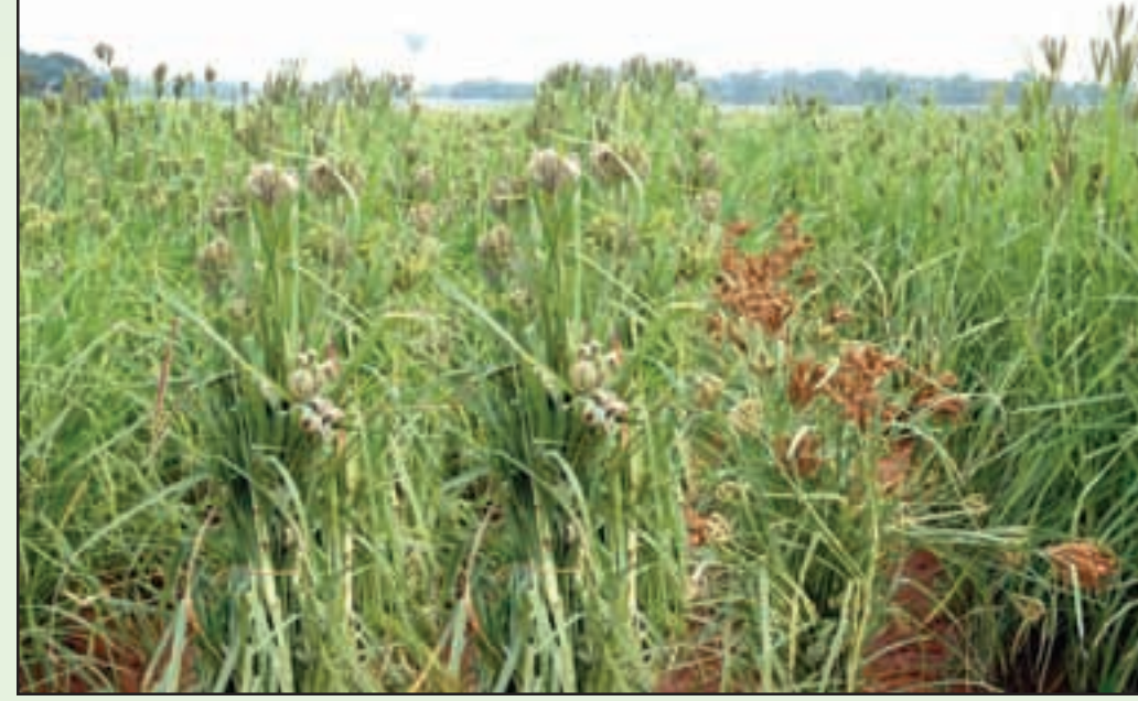
Regeneration of finger millet germplasm.