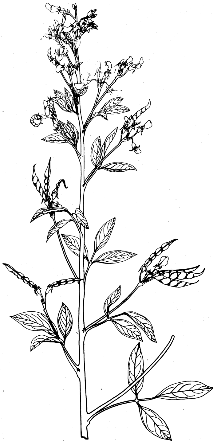
FIG. 1. A primary branch of cv. ICP-1 showing flowers and developing pods. \times 0.5 .