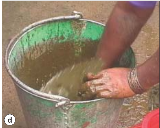
Cow dung slurry