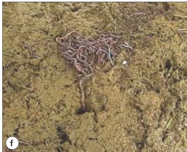
Earthworms are released near cracks