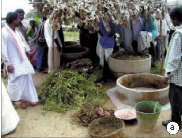
Plastic sheet placed below the ring