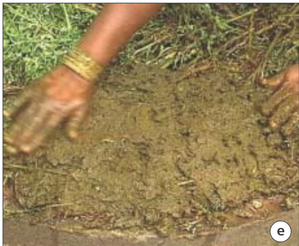
Cement ring sealed with cow dung