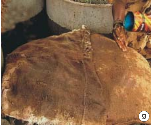
Cement ring covered with gunny bag