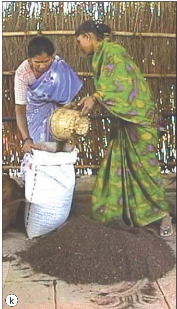
Bag filled with vermicompost