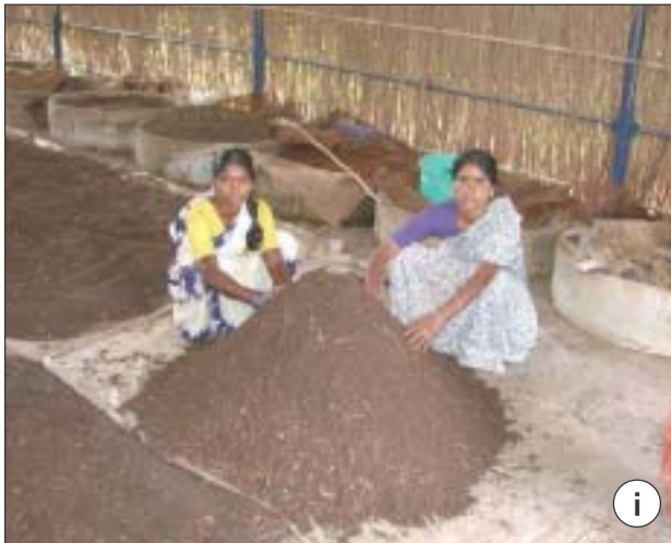
Heaping of vermicompost