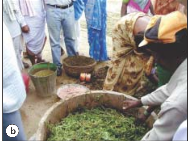
Layer of raw material placed on polythene sheet