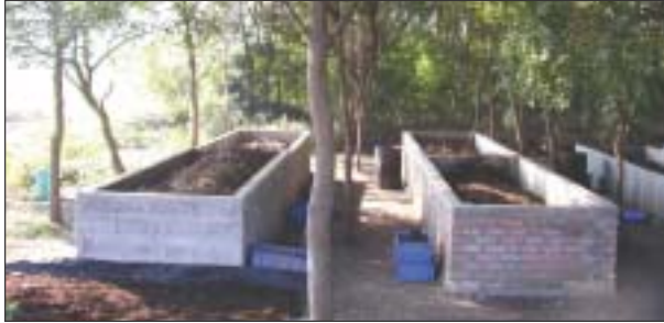
Figure 2. Commercial model for vermicomposting at ICRISAT.