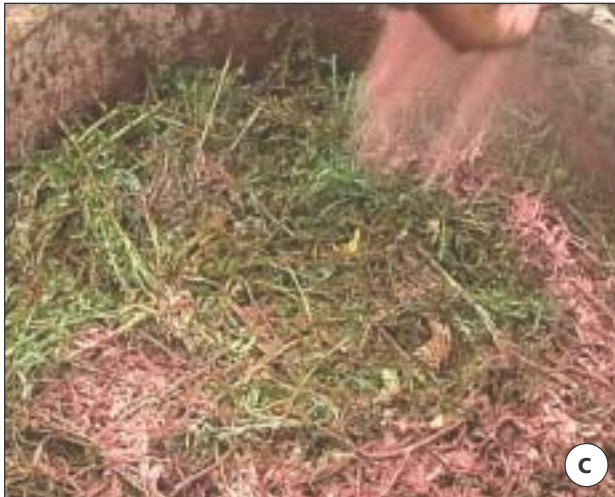
Rock phosphate powder sprinkled on organic material