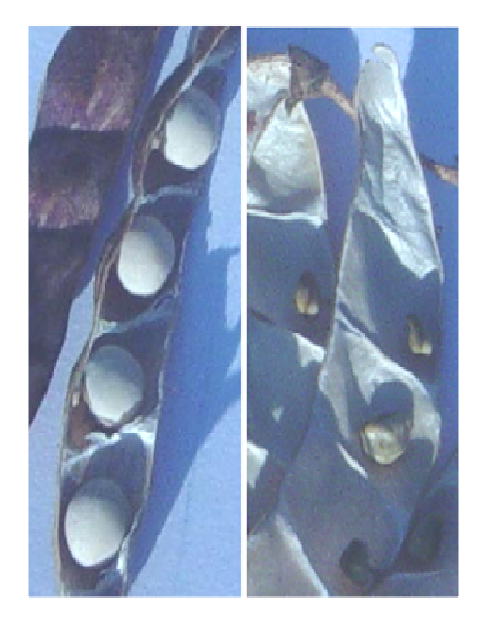
Figure 3. Normal, plumb (left) versus abnormal, shrivelled (right) pigeonpea seed.

than both the commercial cultivar Royes (173 d) and the landrace Mtawajuni (172 d). On average, the time to flowering and maturity among the new germplasm was reduced by 10 d in comparison with that for the unimproved landrace. However, there was a weak correlation ( R^2 =0.45) between 50%DF and 75%DM suggesting that early flowering genotypes may still require a relative-