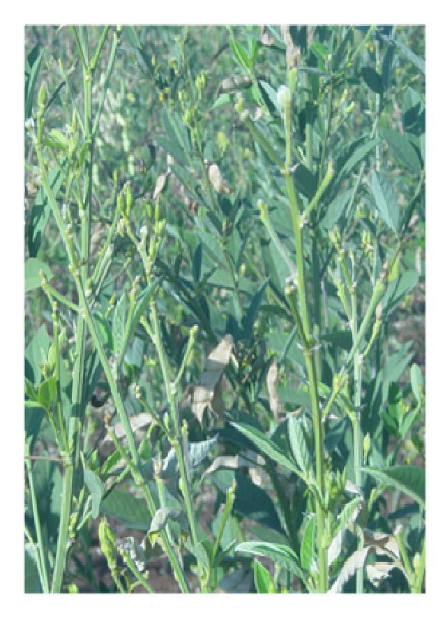
Figure 2. Flower abortion and poor pod development in pigeonpea.

than both the commercial cultivar Royes (173 d) and the landrace Mtawajuni (172 d). On average, the time to flowering and maturity among the new germplasm was reduced by 10 d in comparison with that for the unimproved landrace. However, there was a weak correlation ( R^2 =0.45) between 50%DF and 75%DM suggesting that early flowering genotypes may still require a relative-