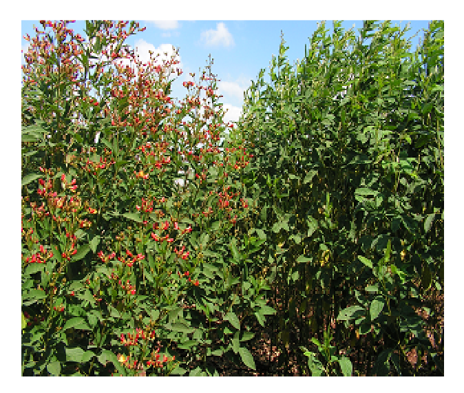
Figure 4. Early flowering (left) in newly developed pigeonpea germplasm adapted to high latitude areas in southern Africa compared with late flowering in a traditional variety.

color of all the elite germplasm was white which is preferred in the market. The highest grain yield (3.0 t/ha) was observed for the cultivar ICEAP 01480/32 compared with 1.0 t/ha attained by Royes (Table 1). Similarly, cultivar ICEAP 01514/15 obtained 2.9 t/ha. Although higher grain yields (>4.0 t/ha) of hybrid pigeonpea have been reported elsewhere (Saxena and Kumar, 2006), it remains unclear whether such technologies can outperform this newly developed germplasm in the high latitude areas in southern Africa. Probably, this enhanced germplasm could be useful in future genetic improvement activities aimed at development of hybrid pigeonpea technologies for southern Africa.