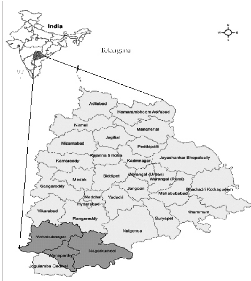
Figure 1. Location of surveyed districts (Mahabubnagar, Wanaparthy, and Nagarkurnool) in Telangana, India

of climate change and the variation to which a system is exposed, its sensitivity, and its adaptive capacity” (IPCC 2007, 27). Vulnerability is seen as a prerequisite for the development of appropriate adaptation strategies and policies. Vulnerability assessments have been used to investigate the complex set of interactions between humans and their socio-physical environments (Hahn, Riederer, and Foster 2009; Panthi et al. 2016; Adu et al. 2018). They capture both natural and socioeconomic processes that lead to vulnerability by measuring the appropriate variables at the appropriate scale, with a suitable conceptual framework. Context-specific measurements that account for the livelihood conditions of the target