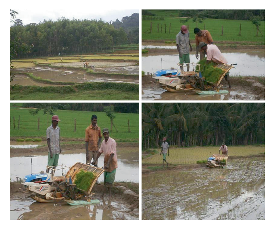
Fig. 8.4 Rice establishment by using transplanting machine reduces the drudgery of women labor, reduces the cost of cultivation, and ensures optimum rice plant population

Direct seeding of rice is done by (1) dry seeding (dry-DSR), (2) wet seeding (wet-DSR), and (3) water seeding (water-DSR) (Kumar and Ladha 2011). As the rice seeds are sown directly, the dry-, wet- and water-DSR methods are often jointly referred to as DSR. At present 23 % of rice area is direct-seeded globally (Rao et al.