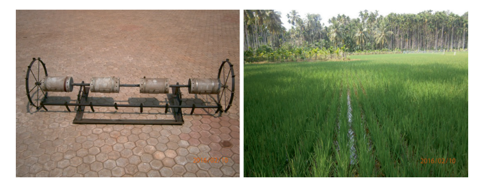
Fig. 8.6 (a) The drum seeder and (b) the crop of wet-seeded rice ( left ) sown by using the drum seeder

transplanting in areas with good drainage and water control (Balasubramanian and Hill 2002). Rice is mostly direct-seeded, with only 6 % area under transplanting, in Latin America (GRiSP 2013). In the water-DSR, pre-germinated rice seeds (soaked and incubated for 24 h each) are broadcast in standing water on puddled (wet-water-DSR) or unpuddled soil (dry-water-DSR). The relatively heavyweight rice seeds sink in standing water, resulting in good anchorage. Water-DSR is used for rice establishment in irrigated lowland areas with good land leveling as in California (United States), Australia, and European countries specifically for managing problematic weeds such as weedy rice. In Asia, some countries like Malaysia are adopting it.