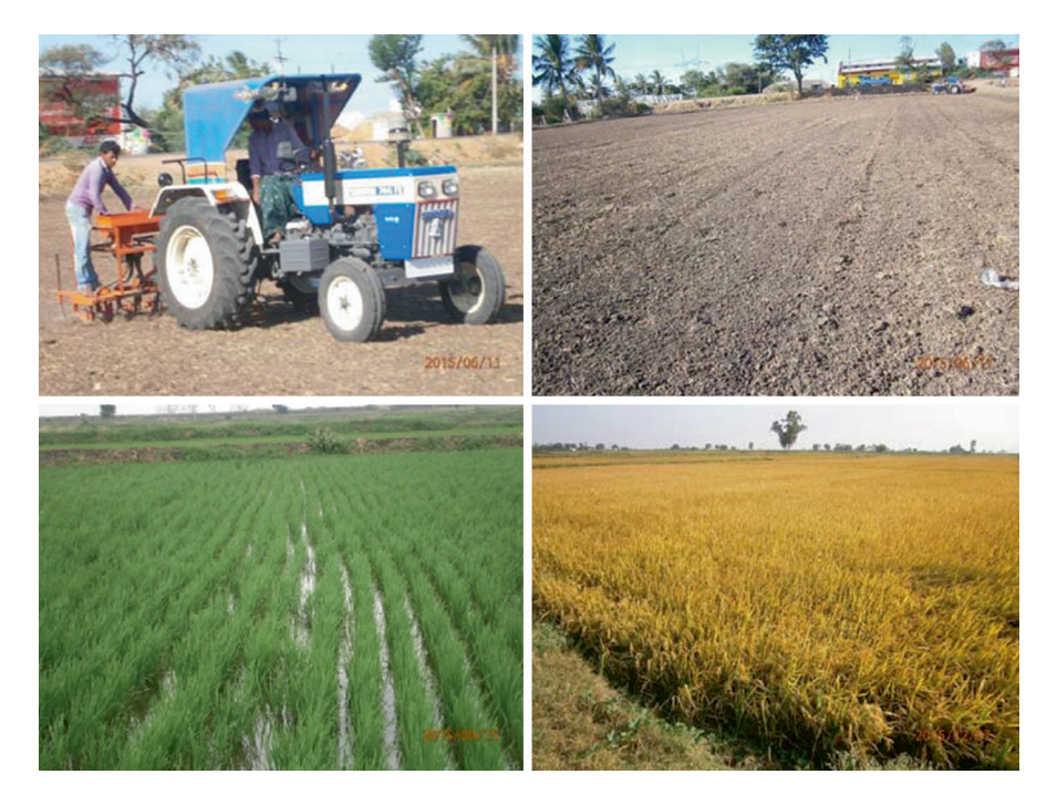
Fig. 8.5 Dry-seeded irrigated rice sown by using seed cum fertilizer drill

Wet-DSR involves sowing of pre-germinated rice seeds in wet (saturated) puddled soils. Wet- DSR is done by broadcasting the seeds on puddled soil or by using a drum seeder (Fig. 8.6). Wet-DSR is practiced in favorable rainfed lowlands and irrigated area with good facility of drainage as in Malaysia, Thailand, Vietnam, the Philippines, and Sri Lanka (Pandey and Velasco 2005; Weerakoon et al. 2011). DSR is becoming an attractive alternative to TPR. Asian rice farmers are shifting to DSR to reduce labor input, drudgery, and cultivation cost (Rao et al. 2007; Kumar and Ladha, 2011). The increased availability of short-duration rice varieties and costefficient selective herbicides has encouraged farmers to try this method of establishing rice (Balasubramanian and Hill 2002). It is quickly replacing traditional