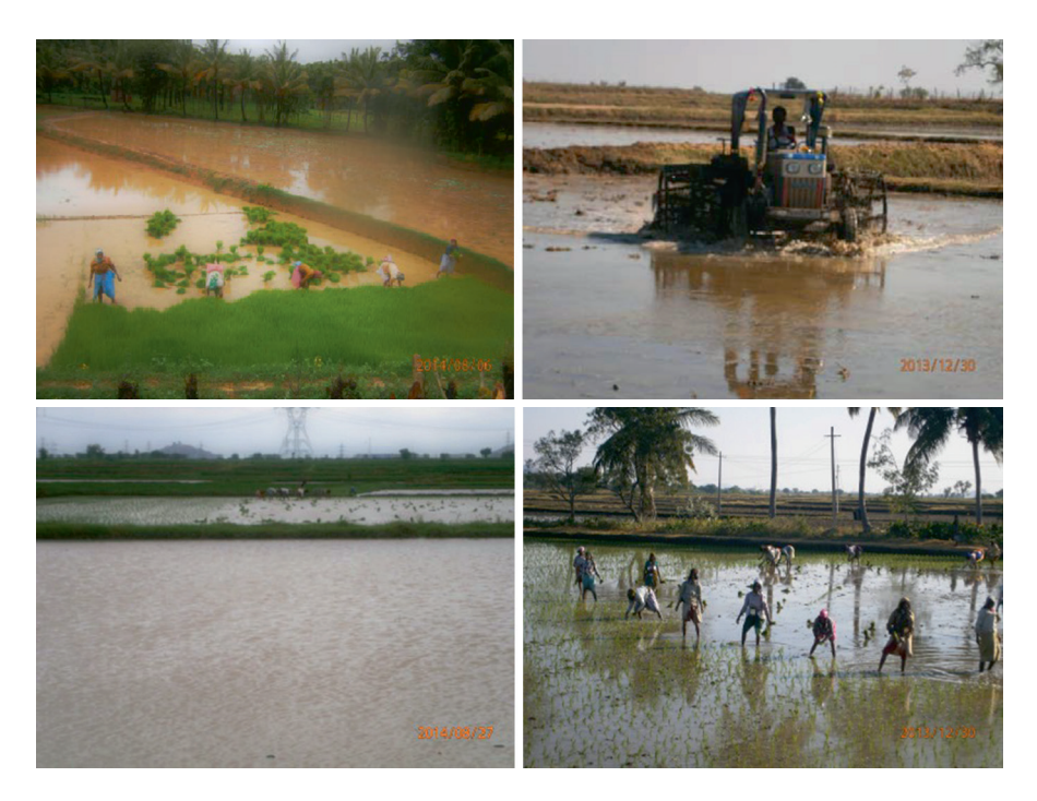
Fig. 8.3 The manual transplanting method of rice establishment uses more labor, water, and energy as it involves processes such as rice seedling nursery raising, seedling pulling, and transplanting in flooded soil conditions

Rice is commonly grown by transplanting seedlings into the puddled soil (wet tillage) in lowlands of Asia (e.g., India, Indonesia, Bangladesh, Myanmar) and Africa (e.g., Madagascar, Mali). Transplanting of rice is done manually (Fig. 8.3) or by machine (Fig. 8.4). The manual transplanting method involves growing of seedlings in a nursery and replanting of 20–30-day-old rice seedlings to puddled soils. The rice seedling nursery may be raised on wet bed or dry bed or dapog or mat or modified mat methods depending on the locality, soil type, rice ecosystem, and the resource availability (for details, refer to http://www.knowledgebank.irri.org/step-by-stepproduction/growth/planting). In several Asian countries, the labor-intensive transplanted rice production systems are being practiced until now, where even the labor supply is abundant due to the population growth. For machine transplanting the rice seedlings are grown in trays or in mat-type nursery in which a thin layer of sol mixed with farm yard manure or compost is placed on a polythene sheet and rice seedlings are raised. Mats of rice seedlings from the trays or mat-type nursery are used for machine transplanting. In Asia, machine transplanters are now being used to establish rice crops in China, Japan, Korea, and Taiwan. In India, farmers started using it in states like Karnataka and Andhra Pradesh. The traditional TPR production system