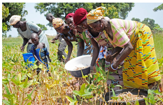
Figure 1: Cowpea harvest - Farmers in Yatenga region, in North Burkina have to cope with erratic rainfall patterns, varying greatly every year.

In Sahelian climatic zones like in Yatenga region in Northern Burkina Faso, farmers are well aware of climate variability. The date of onset and offset of the rainy season as well as the distribution of rainfall along the growing season, significantly impact on their crop yields, and consequently on family incomes and food security.