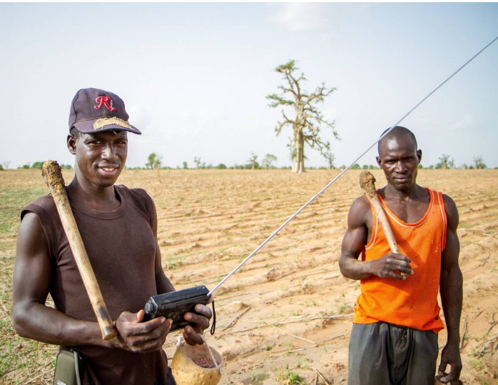
Figure 3: Listening to the daily climate information radio show

A second workshop took place in July to communicate updated climate forecasts for the period July-September.