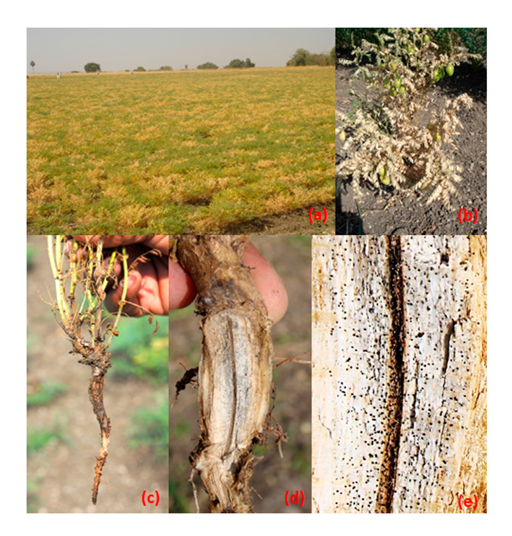
Figure 1. Symptoms of dry root rot disease of chickpea (a) field symptoms, (b) dry root rot infected plant, (c) rotting of root system, (d) and (e) minute sclerotia inside the exposed root.

The DRR symptoms are most commonly observed in chickpea during post-flowering stage which include drooping and chlorosis of petioles and leaflets, initially confined to top leaves of the plant (Figure 1(a) and (b)). Leaves and stems of affected plants are usually straw coloured and in some cases, the lower leaves and stems are brown. The tap root turns black with signs of rotting and is devoid of most of the lateral and finer roots (Figure 1(c)). The dead roots are quite brittle and show shredding of the bark. The