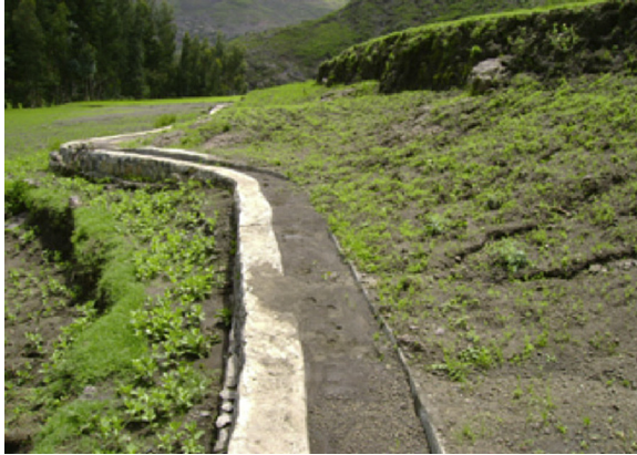
Fig. 2. A secondary canal filled with silt, due to lack of cut-off drains.

with only one surface flow measurements, or based on rainfall data from a distant weather station. Farmer input into scheme design was commonly minimal. In situations when farmers vocally raised concerns about the proposed design, they were not able to influence decisions. In some cases, the uppermost weir had covered springs and redirected water back underground, resulting in the rejection of the scheme by farmers (e.g. Zatta scheme in Tigray) or the amount of irrigable land substantially decreased because of upstream diversion (e.g. Chelekot). Not all engineers were top-down, however. For instance, in one small-scale irrigation scheme in Southern region, the engineers modified the design of the stop log from metal to wooden log in response to farmers' fear of theft (Kahsay, 2011).