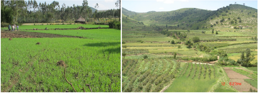
Fig. 1. Ten-year old small-scale irrigation schemes with different levels of intensification: Barley production in the Leza scheme in the Amhara region (left), and an intensified and diversified scheme in Oromia region, Burka woldya, Ethiopia (right).