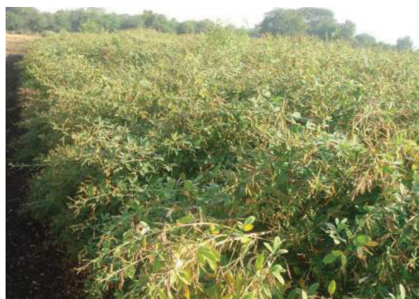
Figure 1. A commercial crop of pigeonpea.

The presence of high genetic diversity made [2-4], to believe that India is the primary center of origin of cultivated pigeonpea from where it spread to Africa about 4000 years ago. There are several local names of Cajanus cajan in different parts of the world [5]. Among these “pigeonpea” is the globally popular name that was coined by [6] in Barbados, where the crop was grown in barren lands for feeding its seeds to pigeons. In India it is popularly known as red gram, tur, or arhar. Pigeonpea is a perennial plant ( Figure 1 ) and it can survive up to 3-4 years [5]. It is a short-day plant with a high sensitivity to photo-periodic changes. There are two major growth patterns in pigeonpea; the determinate types which produce pods in clusters at the top of the canopy and its further growth ceases after flowering that results in more or less uniform maturity. The other and most common growth habit is non-determinate type, where the pods are borne in axillary clusters. In general, the later types can tolerate major biotic and abiotic stresses due to their inherent capacity to regenerate. The traditional pigeonpea cultivars and most landraces are tall and take about 180-280 days to mature. However some early maturing