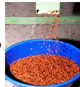
Clean graded seeds