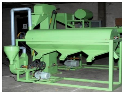
Cylindrical grader cum sorter