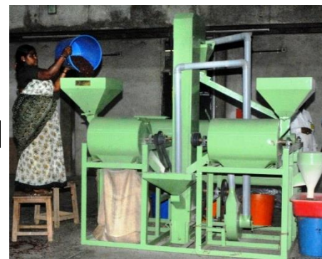
Double roller mini dal mill