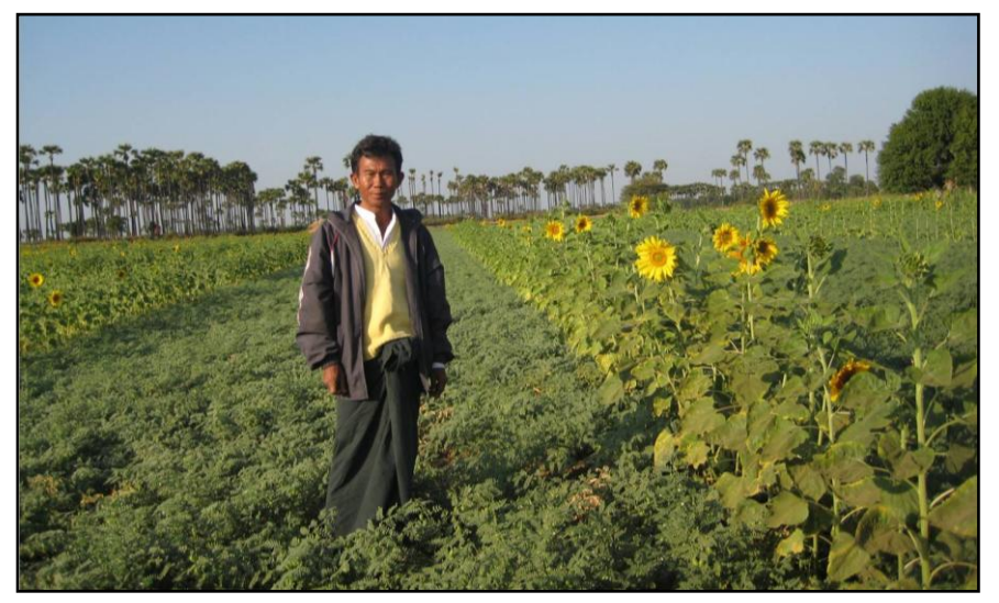
Figure 3. Intercropping with chickpea and sunflower in upland condition