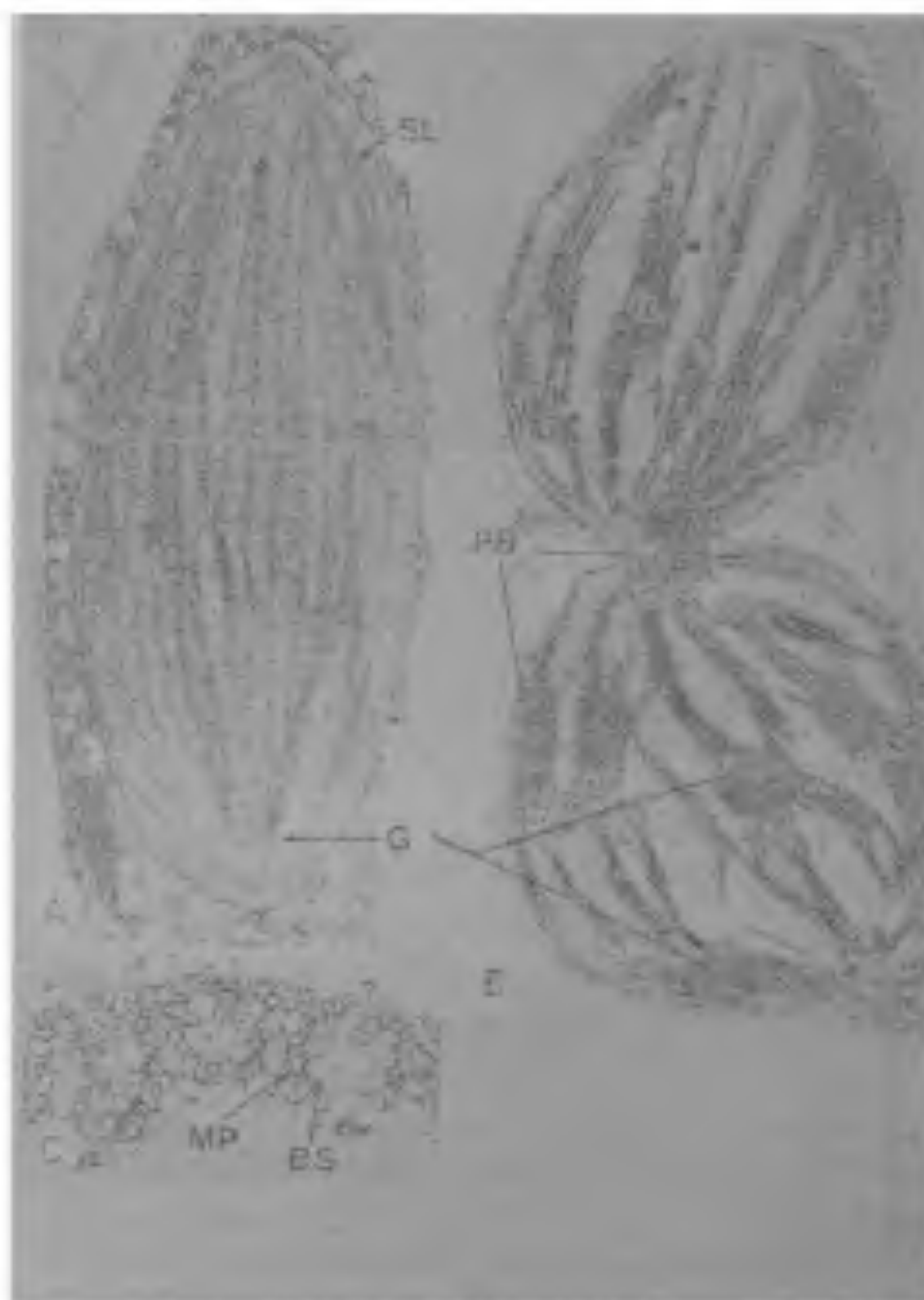
Figures 1A–C. A. Bundle sheath cell chloroplast from leaf tissue of Dinanath grass showing very few grana (G) and frequent appearance of stroma lamellae (SL). B. Mesophyll cell chloroplast showing well developed several grana (G) and prolamellar bodies (PB). C. Cross section through a mature leaf of Dinanath grass showing well differentiated bundle sheath and mesophyll cell layer.

IN recent years, electron microscopy and biochemistry of C_3 and C_4 plants have been extensively studied. Hatch and Slack 1 of Australia reported some dicots, sugarcane and several other members of Graminae and Cyperaceae to be C_4 plants. The most distinguishable anatomical feature of leaf of C_4 plants is the Kranz anatomy i.e. , the occurrence of dimorphic chloroplasts. A perusal of literature reveals that little is known about the anatomy and pathway of photosynthetic CO_2 fixation in Dinanath grass—a grass of arid and semi-arid zones. The present study was undertaken to