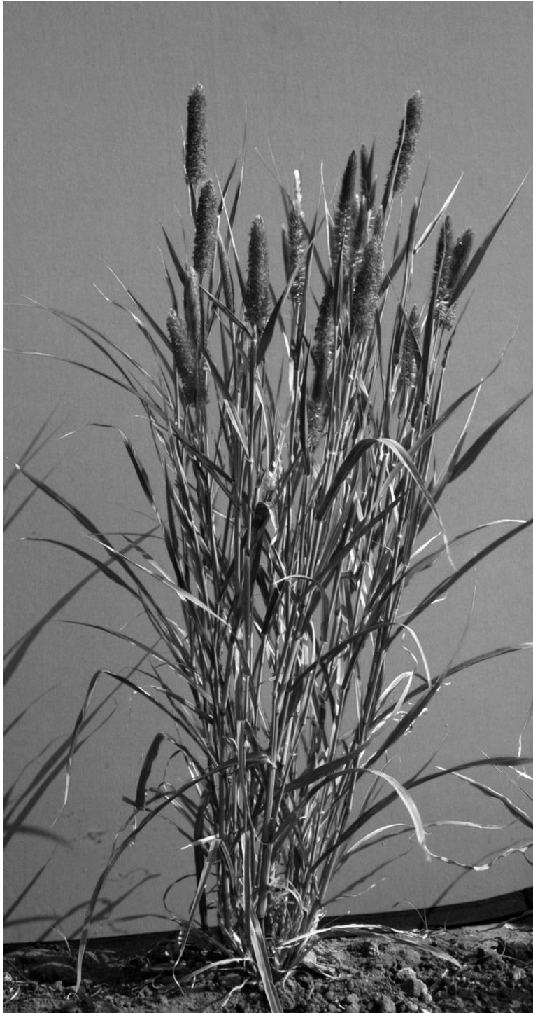
Fig. 1. Plant of Pennisetum glaucum subsp. monodii .

were recorded on ten quantitative traits and nine qualitative traits. The qualitative traits were growth habit, stem colour, leaf blade pubescence, leaf shape and colour, panicle shape and density, bristle length and green fodder yield potential on plot basis. Panicle density was