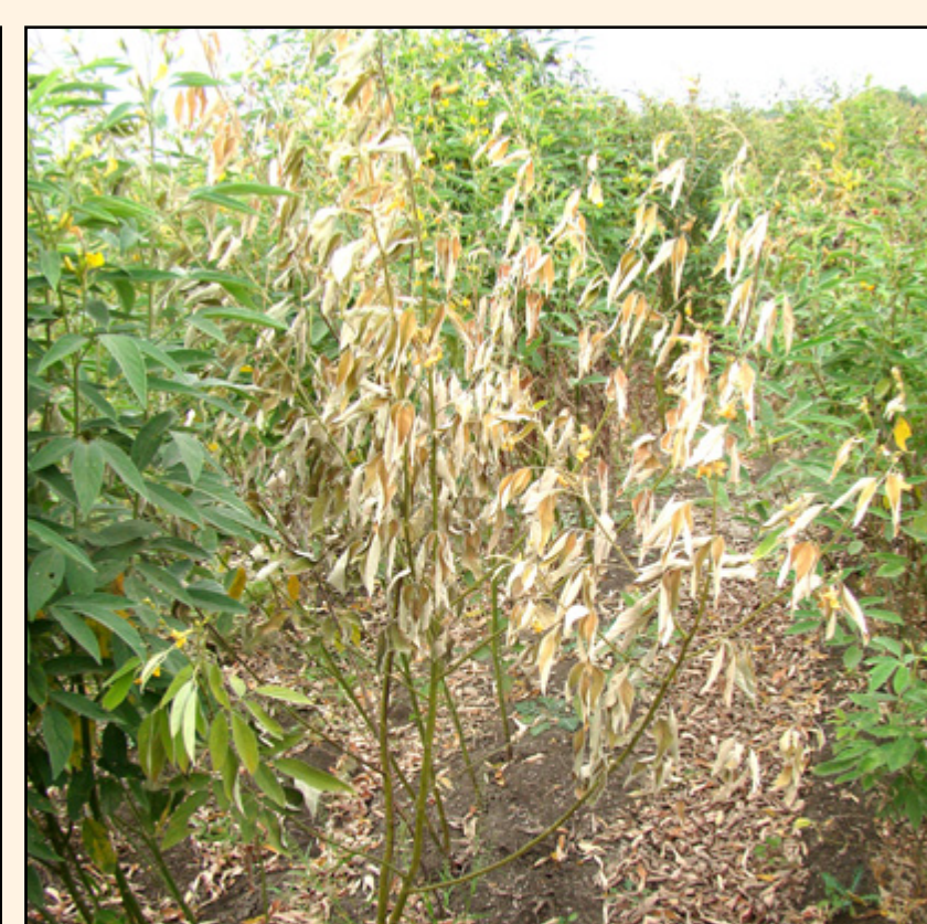
Fusarium wilt disease.