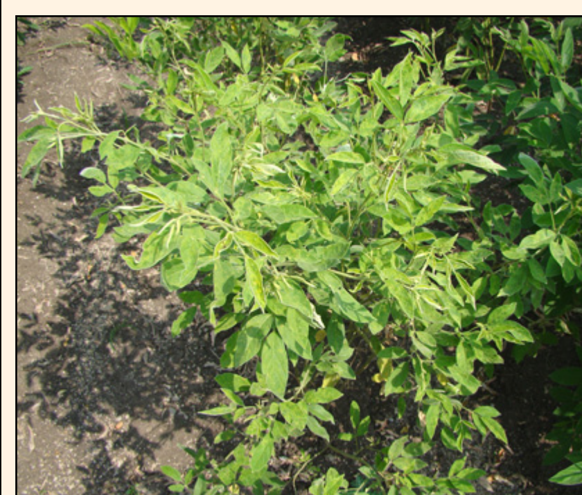
Sterility mosaic disease.