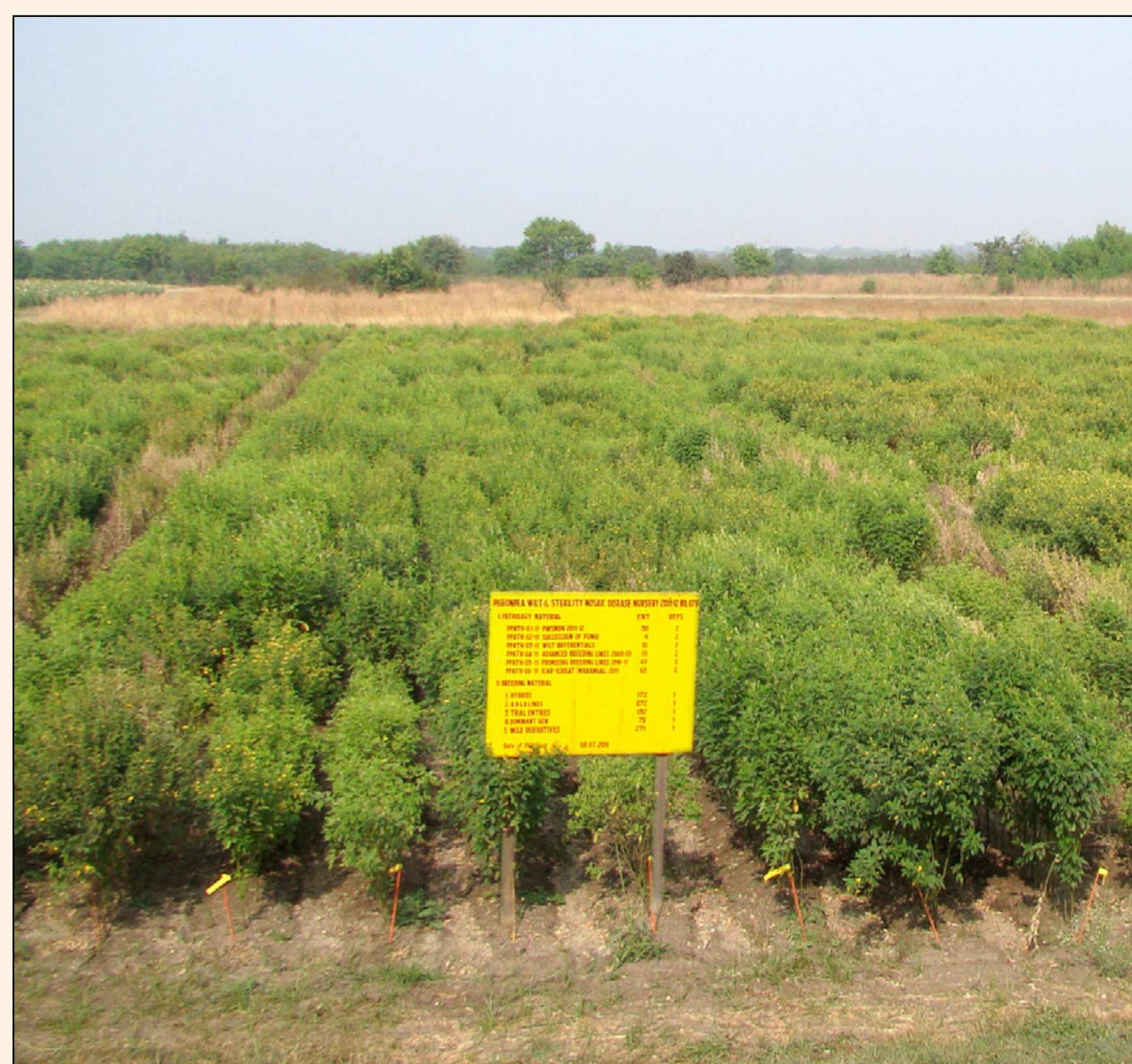
Sick plot nursery at ICRISAT, Patancheru, AP, India.