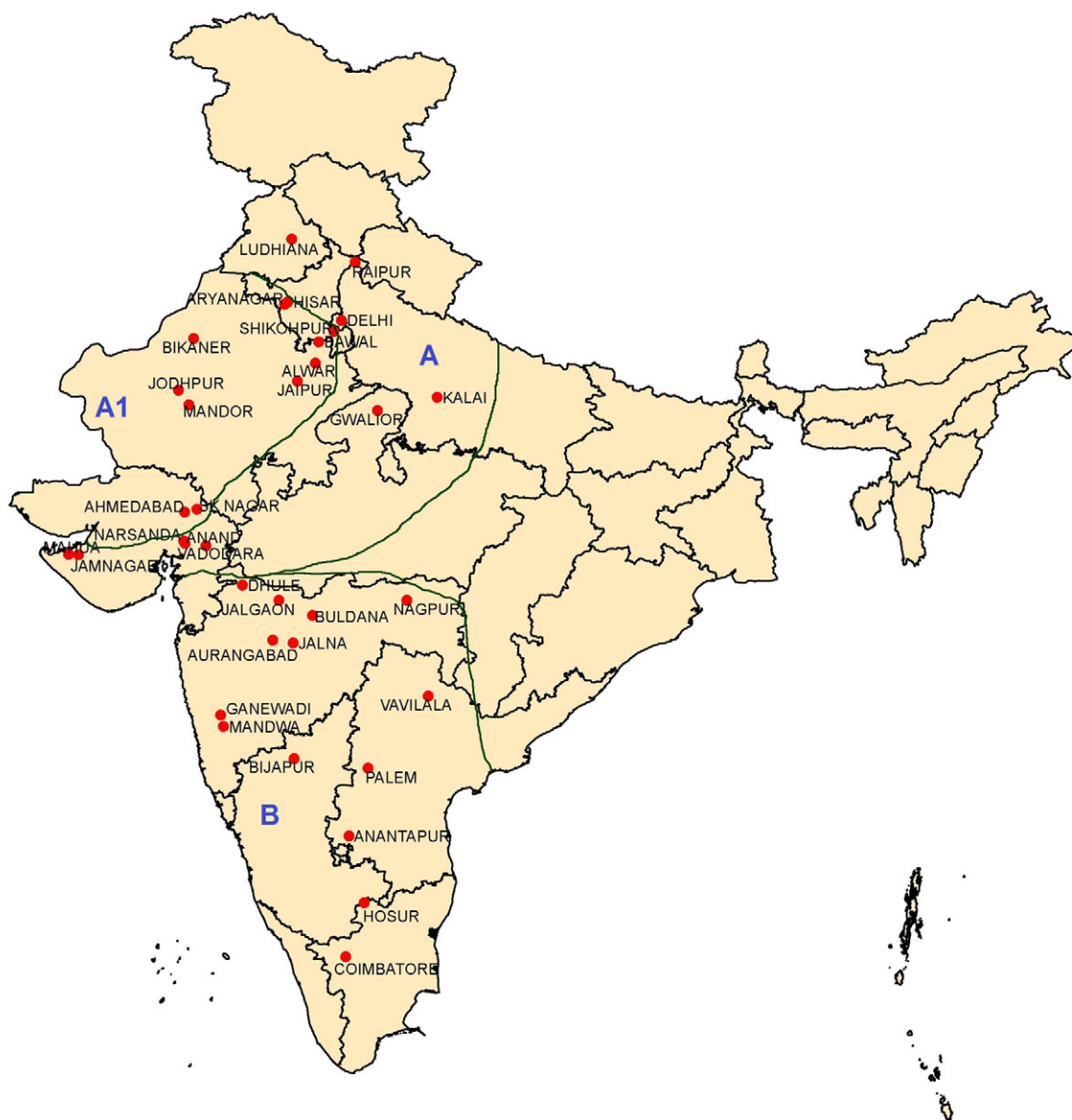
Figure 1. Geographical positions of the pearl millet testing locations of Initial Hybrid Trial conducted by the All India Coordinated Pearl Millet Improvement Project in India under different crop zones ( A_1 , A, and B) in 2006, 2007, and 2008. See Table 1 for details on locations.

with high discriminating power. Locations in a particular year were partitioned into groups. Locations that came together in a cluster and closely related to one another in terms of genotype performance were pooled into smaller groups. In the process to identify essential test locations, if the test locations are highly similar, it may be possible to drop a few locations without much risk of losing a significant amount of information about the genotypes. Biplots were also constructed for the identified essential test locations. The rank correlations among the test locations of a particular mega-environment were used to find the degree of closeness among them (Malla et al., 2010).