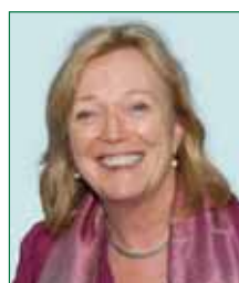
Gry Synnevag, Norway NORAGRIC – Centre for International Environment and Development Studies Agricultural University of Norway PO box 5001 N-1432 As Norway