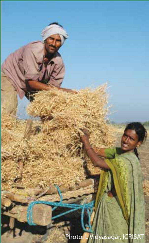
Farmers of Guntur District, Andhra Pradesh harvest chickpea.