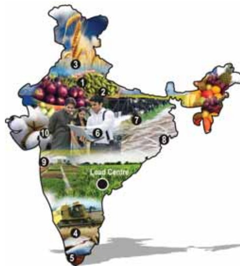
NIABI, a gateway for agri-business ventures to take off.

In 2011, to help sustain the rising demand for jobs, incomes and value added agricultural products in sub-Saharan Africa, ICRISAT launched a South-South Initiative (IS-SI) for Indian-African partnerships in agricultural research-for-development. This increased the reach and impact of ICRISAT in the global fight against poverty and hunger, a reach that has been extended further by the participation of ICRISAT-ABI in the Universities, Business and Research in Agricultural Innovation (UniBRAIN) initiative, which is led by the Forum for Agricultural Research in Africa (FARA) with generous support from the Royal Danish Ministry of Foreign Affairs (Danida). UniBRAIN is promoting agribusiness incubation in sub-Saharan Africa by supporting the six agribusiness incubators mentioned earlier, which now form the nucleus of an African network, similar to NIABI. In addition, food processing incubation centers and food testing laboratories have also been set up in Africa.