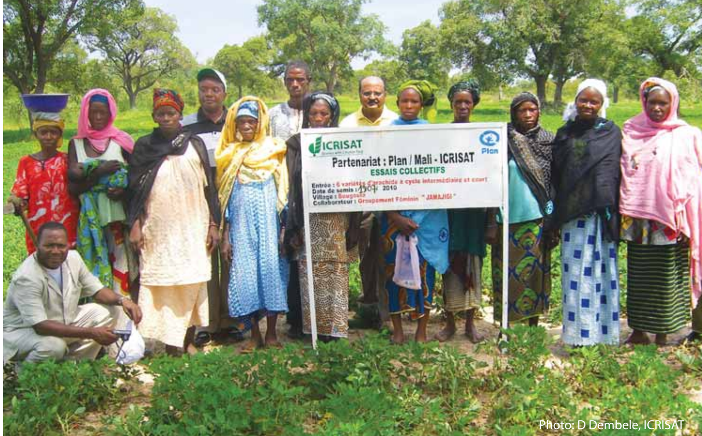
ICRISAT scientists with partners from Plan Mali- Sanambélé.