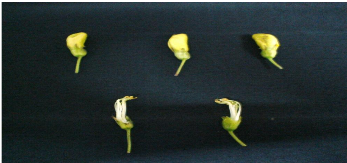
Figure 9. Cleistogamous flower structure