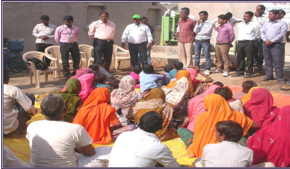
Figure 13. Dr KB Saxena, Principal Scientist, ICRISAT addressing the Villagers at Padasoli, Jaipur during the inaugural function of Mini-dal mill