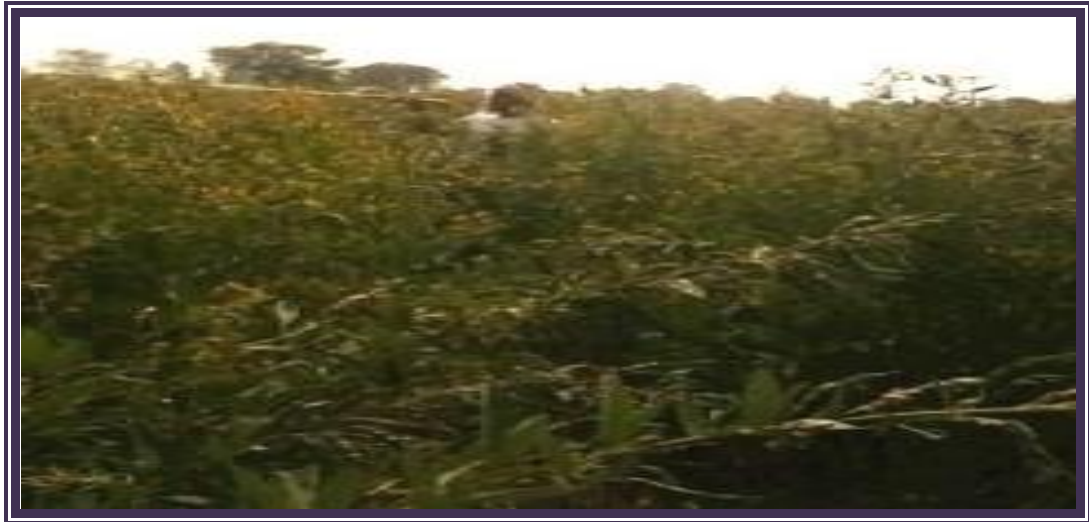
Figure 7. Spraying at pod filling stage at Padasoli village, Jaipur district