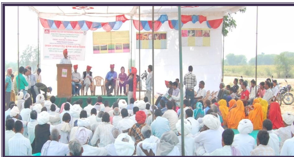
Figure 3. Farmers' Field Day conducted at Padasoli, Jaipur district, Rajasthan