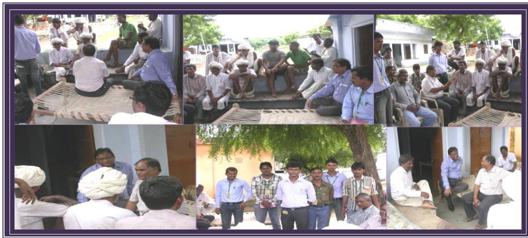
Figure 2. Interaction with the farmers of Padasoli, Jaipur district during the visit of DR KB Saxena, Principal Investigator of the project, ICRISAT, Patancheru