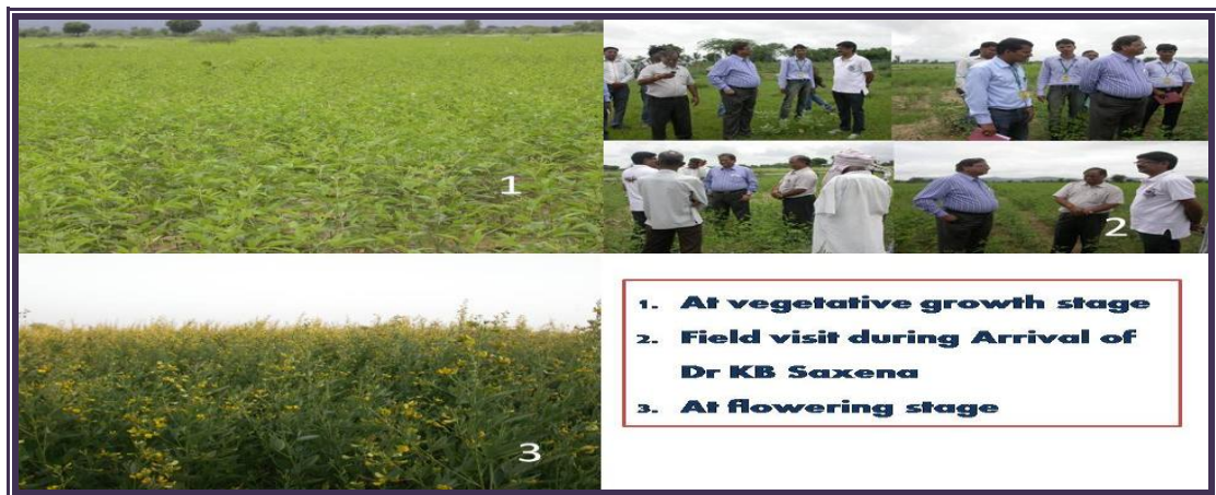
Figure 8. An excellent pigeonpea seed production plot at Lalwas, Jaipur district