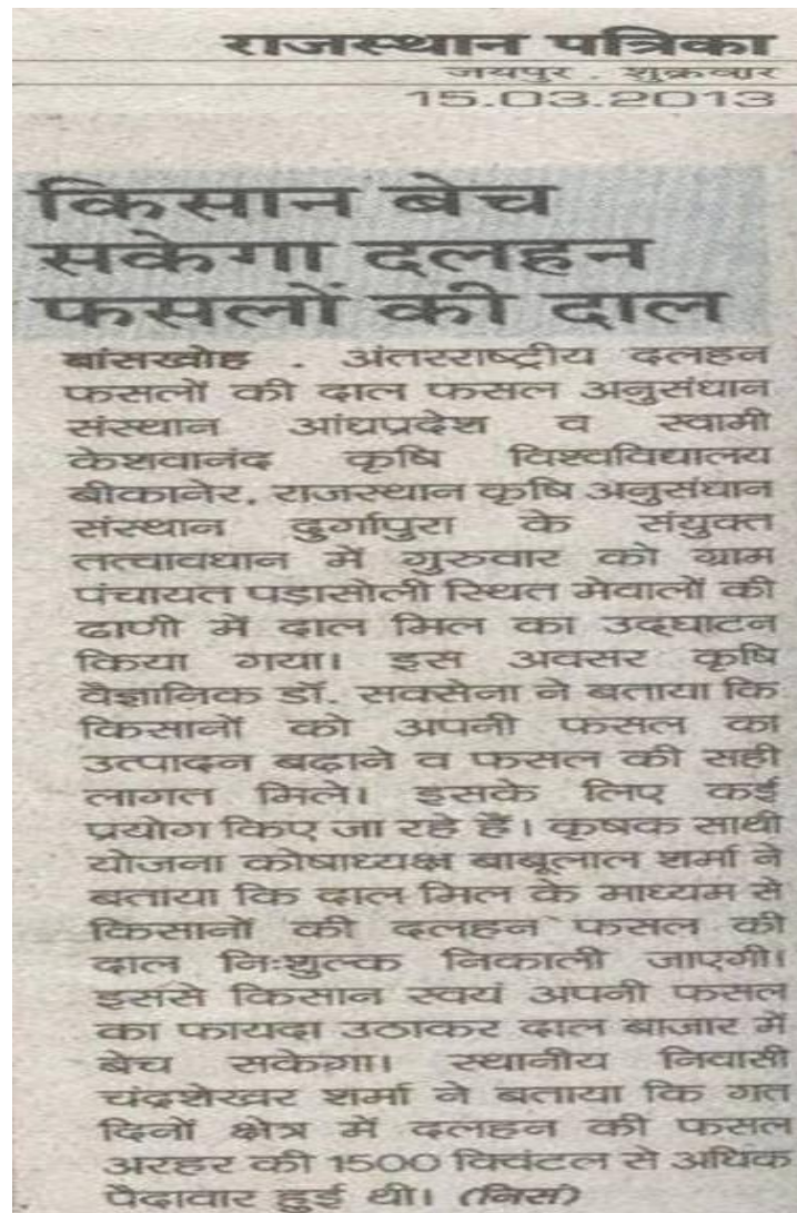
Fig 14. The 'Rajasthan patrika' covered the news of Mini-dal mill inaugural function