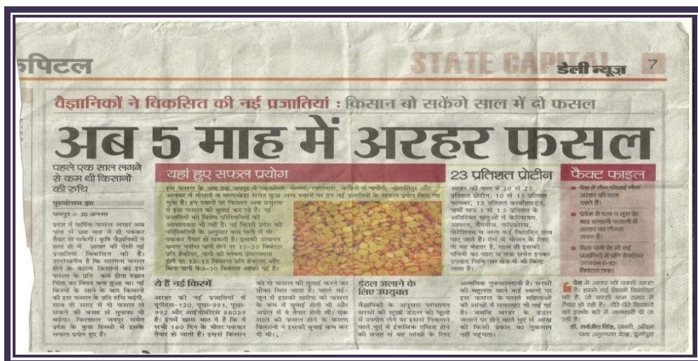
Figure 12. An item on cultivation of pigeonpea in rainfed regions of Rajasthan was published in a daily newspaper, 2 September 2012