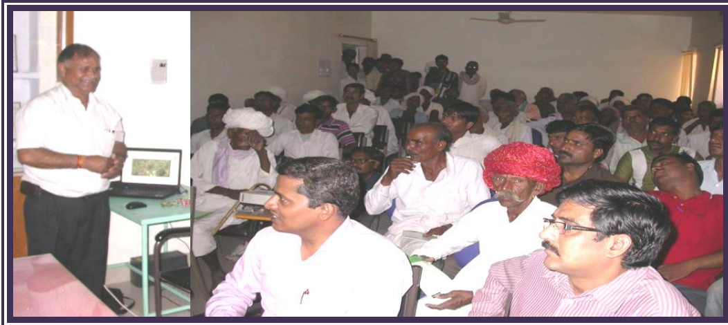
Figure 1. Training program on pigeonpea production conducted at ARS, Durgapura (Rajasthan)