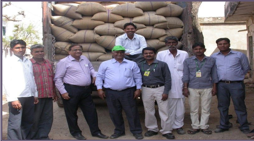
Figure 15. Seed lifting by Local Private Seed Company at Padasoli village of Jaipur district