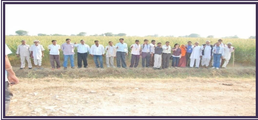
Figure 4. Field visit along with Padasoli farmers during Field Day