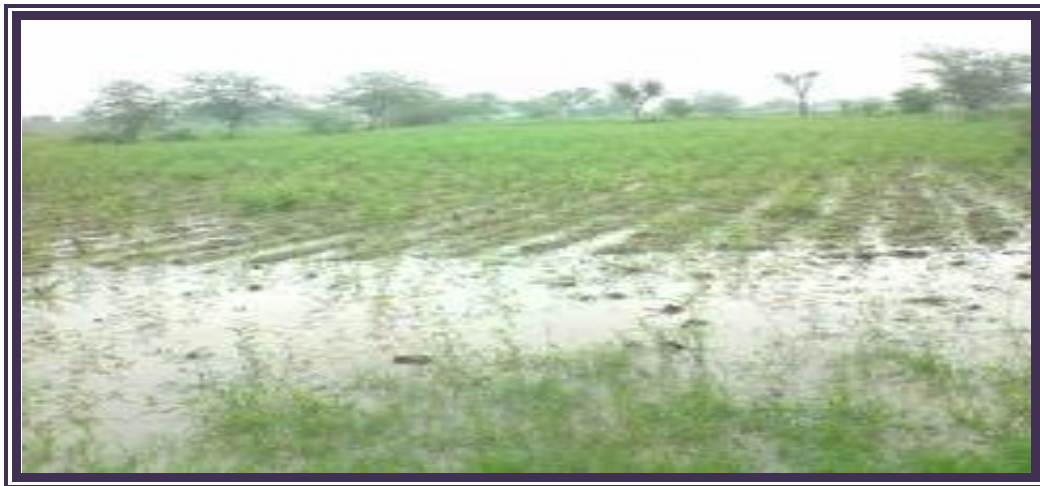
Figure 5. Waterlogging in a farmers' field in Karauli district