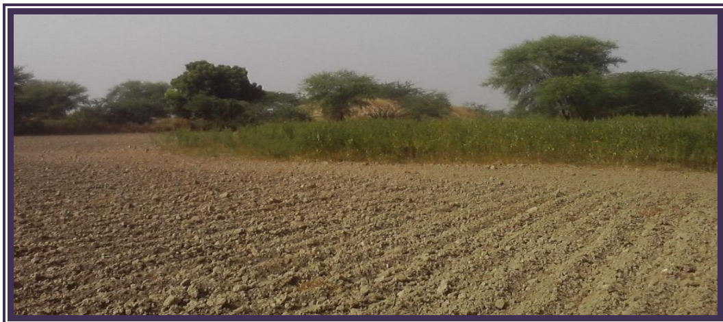
Figure 6. Crop lost due to waterlogging in a farmers' field in Karauli district