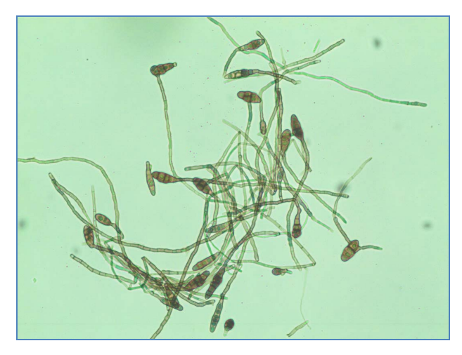
Figure 2. Conidial and mycelial morphology of Alternaria alternata.

in the field symptoms on leaves were small, circular, necrotic spots that developed quickly forming typical concentric rings. Later, these spots coalesced and caused blighting of leaves. Spots were initially light brown and later turned dark brown were observed 10 days after inoculation.No symptoms were observed on control plants.