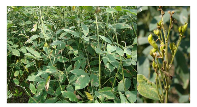
Figure 1. (A)Alternaria blight symptom on leaves and (B) aerial plant parts (leaves, stem, buds and pods).

The pathogen proved pathogenic on pigeonpea cultivar ICPL 87119 and identical disease symptoms as observed