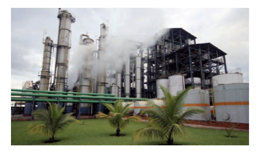
Fig. 2 Moema sugar mill located in Orindiuva, Sao Paulo, Brazil, producing transport-grade biofuel ( Source Moraes 2011)