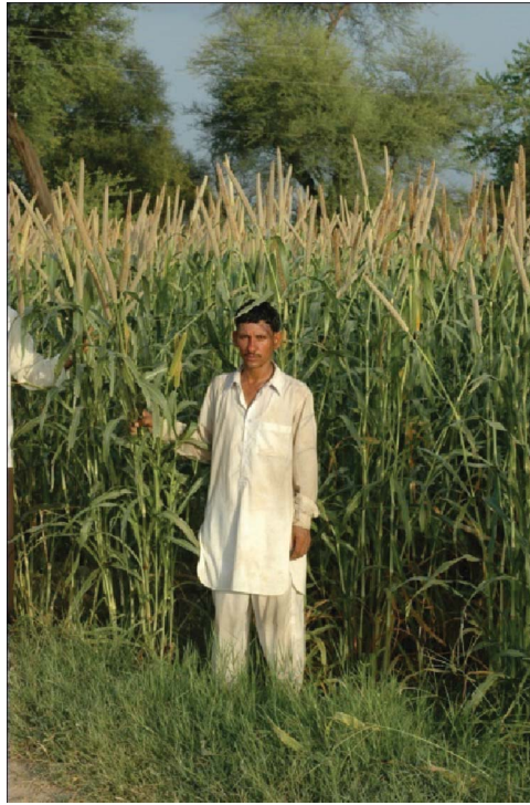
FIGURE 3 A farmer shows off his downy mildew-free crop of pearl millet hybrid ‘HHB 67-Improved’ (color figure available online).

and develop cultivars that are stable in expression of resistance to the target pests under variable climate. Relationships between pests and their natural enemies will change as a result of global warming, resulting in both increases and decreases in the status of individual species. Quantifying the effect of climate change on the activity and effectiveness of natural enemies will be a major concern in future pest-management programs.