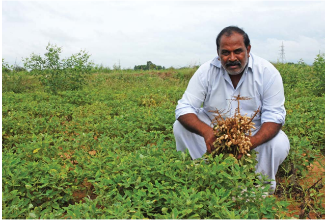
FIGURE 2 ICRISAT's climate-smart short-duration groundnut cultivar 'ICGV 91114' escapes terminal drought (color figure available online).

What we need to better understand is the physiological mechanism underlying heat tolerance, and to identify wider gene pools to develop crops with wider adaptability and to develop more effective germplasm-screening techniques for desired traits. ICRISAT's gene bank holds more than 119,000 accessions from 144 countries that will help safeguard and exploit genetic diversity to enhance adaptation.