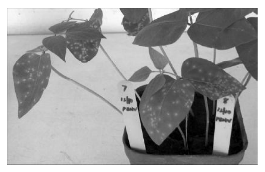
Plate 1. Chlorotic lesions of PBNV on local lesion cowpea cv. C-152.