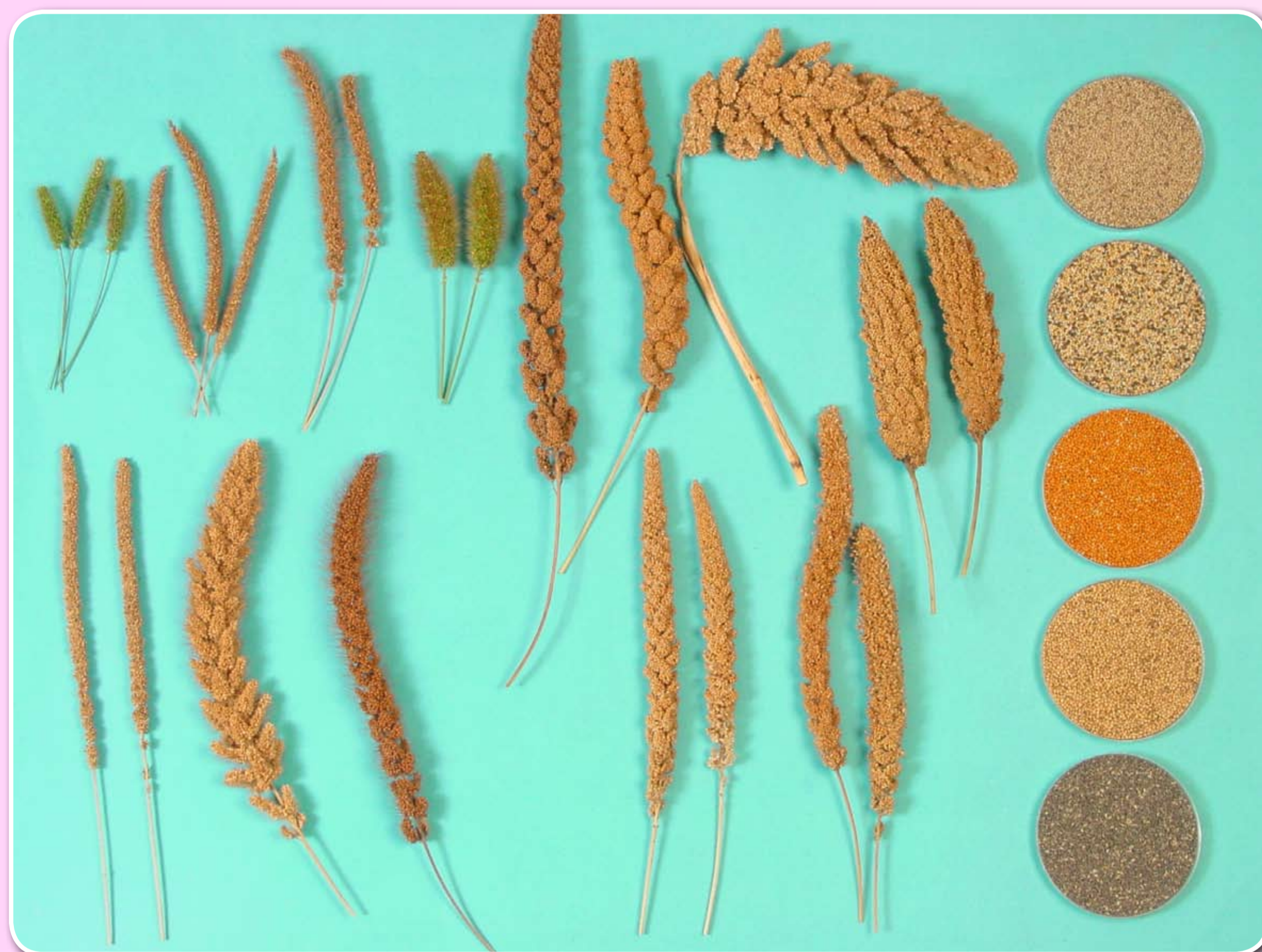
Variation in inflorescence size, shape and seed color.

Landraces – 1470 Improved cultivars - 11 Wild accessions -54