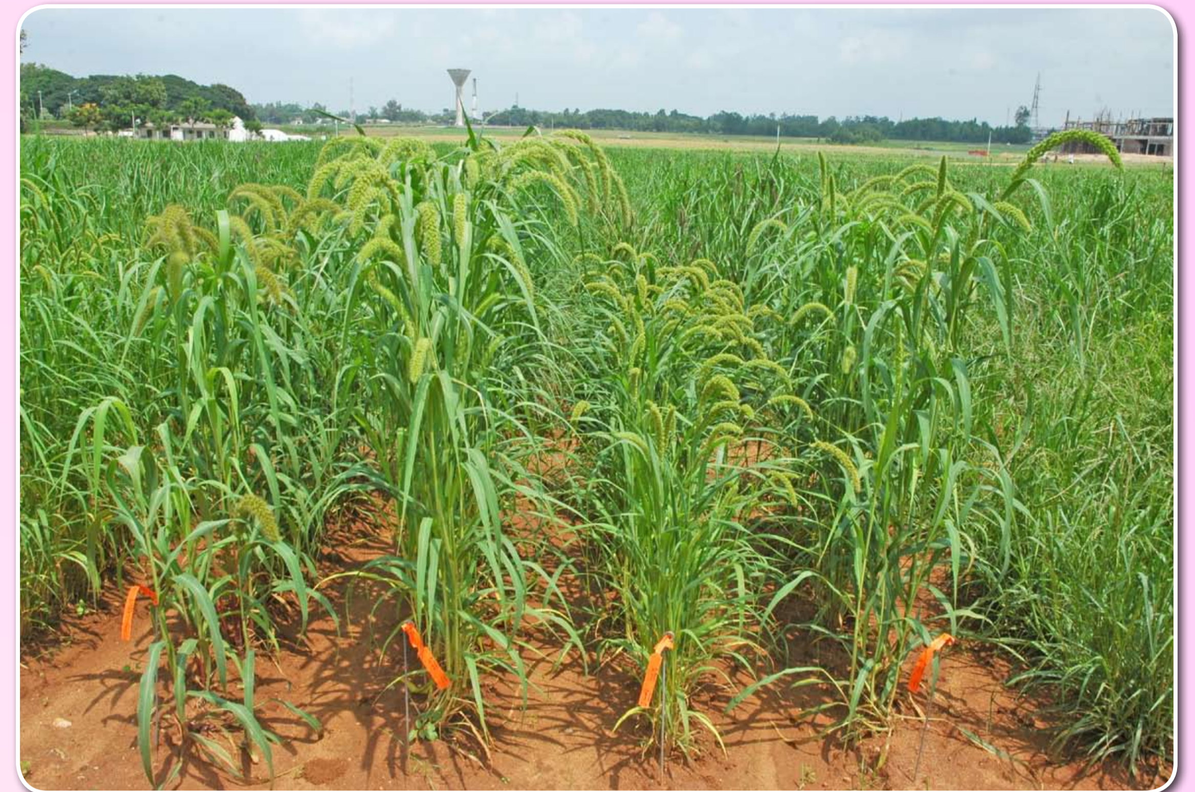
Field evaluation of reference set.

Two hundred accessions along with four controls (ISe 375, 376, 1468 and 1541) were evaluated for 20 morpho-agronomic traits during the two rainy seasons at Patancheru, India. Accessions with desirable traits have been identified.