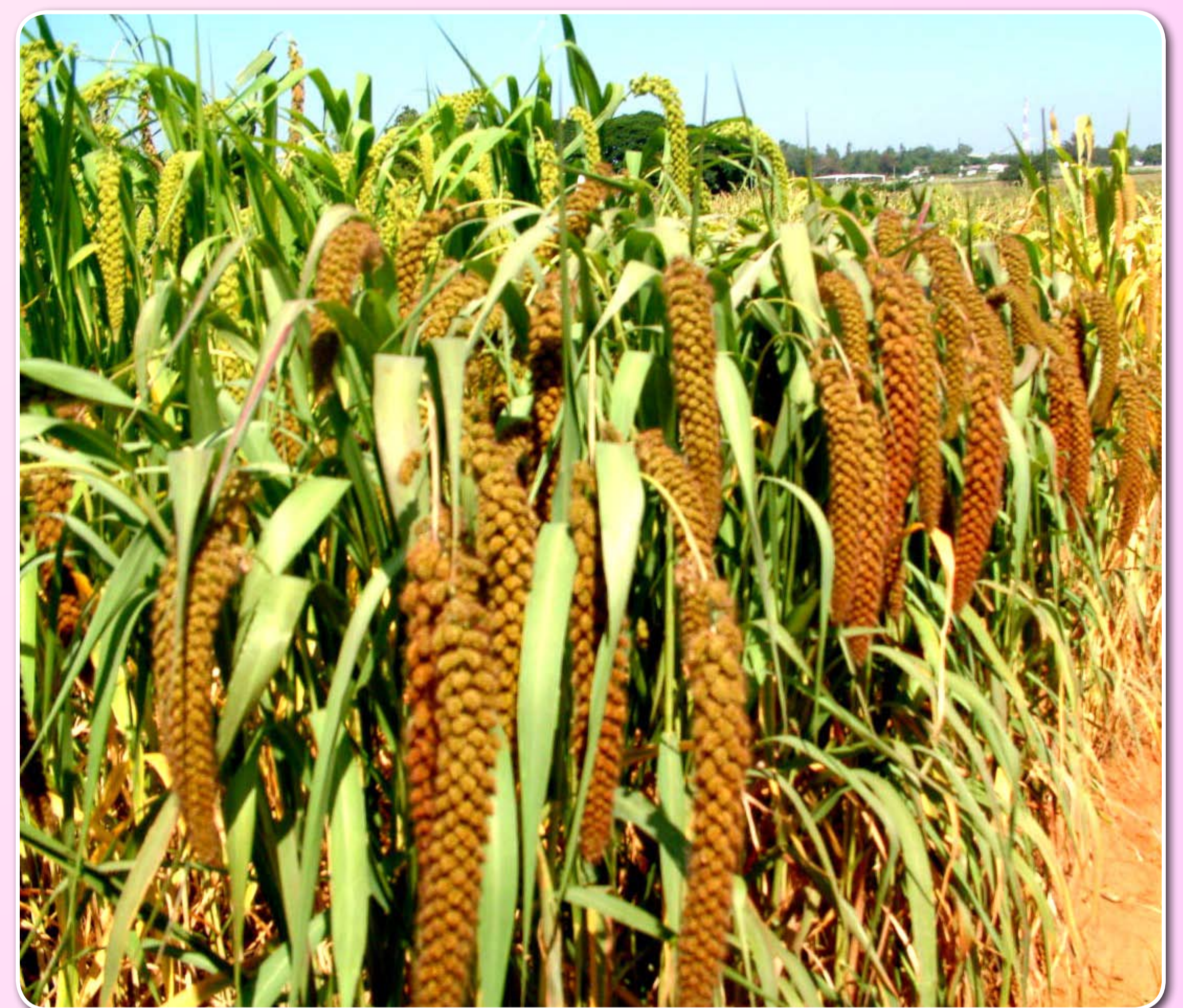
A high yielding accession with large panicle.