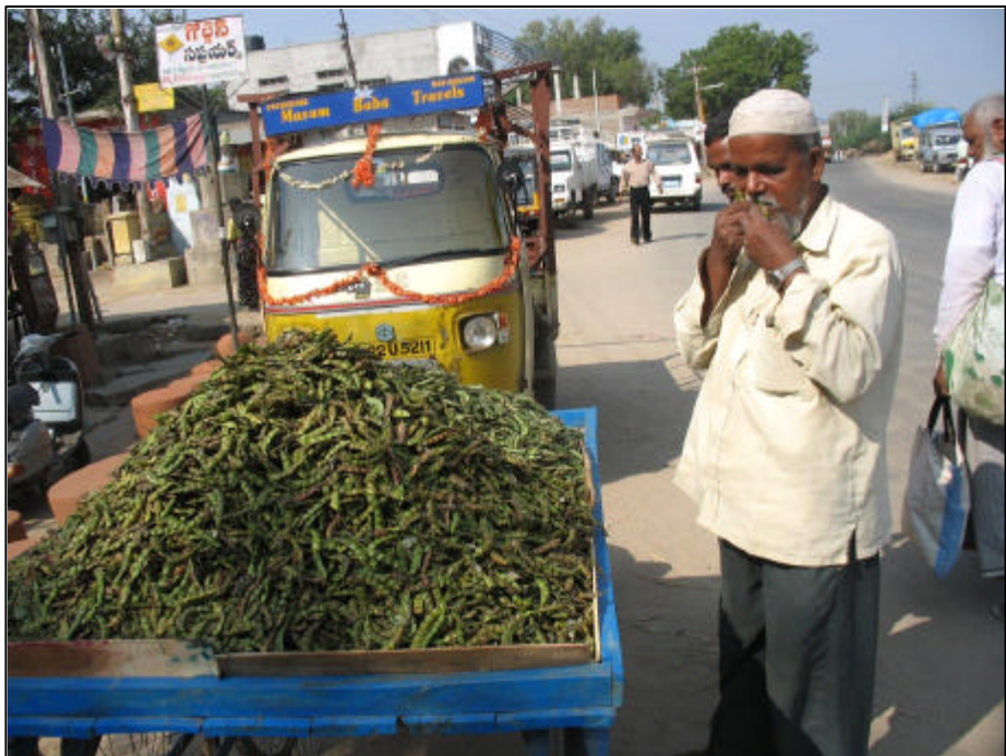
Figure 15.5: Green pods are sold in retail market in India.