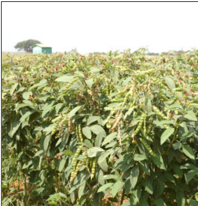
Figure 15.1(a): Determinate type of plant.

There are two major plant growth habit groups in pigeonpea, and these are designated as determinate and non-determinate. The determinate (Figure 15.1a) type plants have pods in clusters at the top of their canopy and a somewhat corymbs-shaped inflorescence terminates the plant growth. Hence, the plant growth almost ceases after flowering and maturity of such plant is relatively uniform.