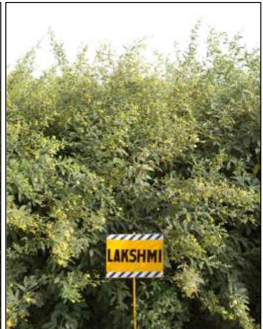
Figure 15.1(b): Non-determinate type of plant.