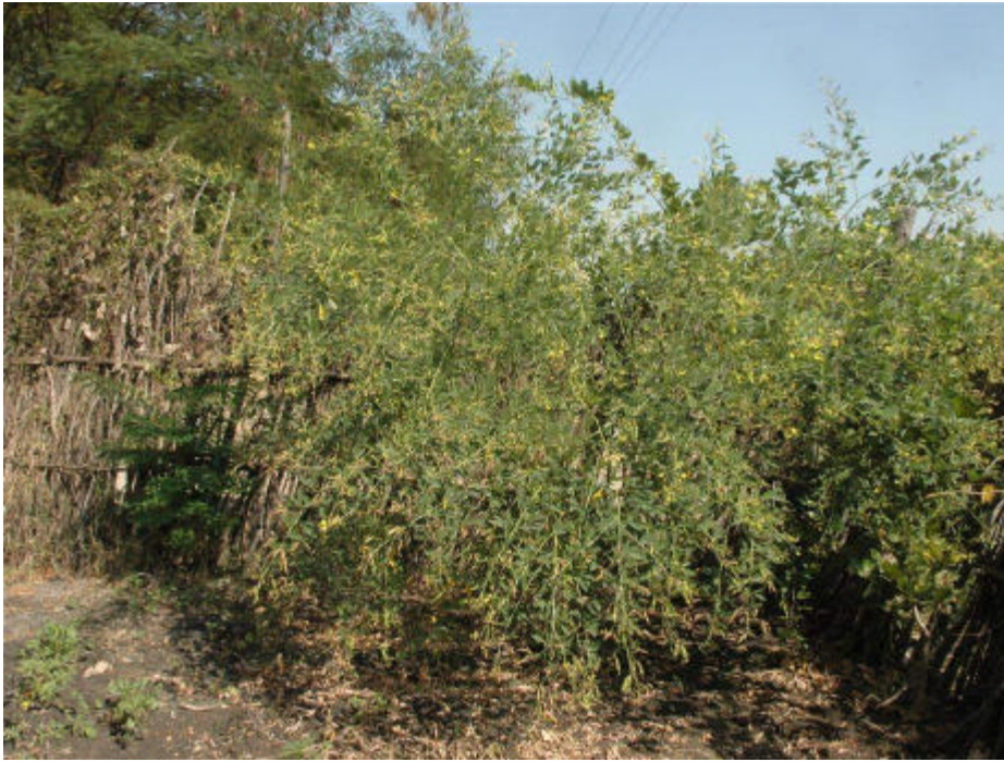
Figure 15.4: A backyard crop of vegetable pigeonpea for domestic use.