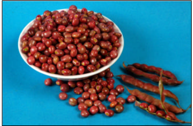
Figure 15.3: Seeds and pods of vegetable pigeonpea line ICP 7035.

Sweetness of fully grown green seed is also a preferred trait. Normal sugar content in green pigeonpea seeds are around 5.0 per cent; but researchers at ICRISAT have identified a line (ICP 7035) with a sugar content as high as 8.8 per cent. ICP 7035 is highly resistant to Fusarium wilt and sterility mosaic virus disease. Its flowers are dark red that produce purple coloured pods. The seeds of ICP 7035 are large, purple with a mottle pattern; while its pods are 7–8 cm long and, on average, contain six seeds (Figure 15.3). Another cultivar T 15–15, is widely grown in Gujarat state, India for both green and dry seed harvests. In southern India, the large-seeded lines such as HY–3C and TTB–6 are popular as vegetable. In hilly tribal areas of India many large-seeded landraces are traditionally grown for vegetable purpose. Scientists at ICRISAT have also bred an early maturing, determinate variety ICPL 87 which is also used for dual purpose. It produces pods for relatively longer time and allows 2–4 pickings within a crop season.