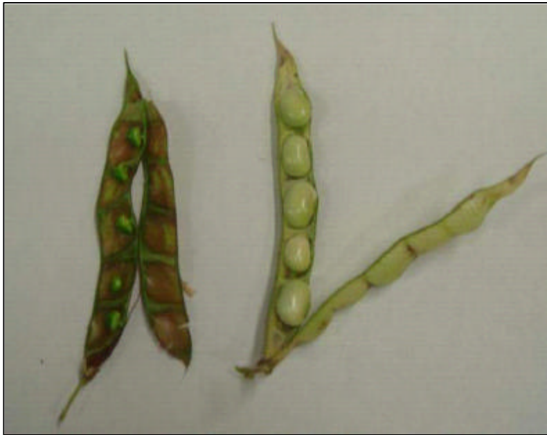
Figure 15.2: Ovule abortion (left) in a developing pod.

the anti-nutritional factors such as phytolectins are heat sensitive and are destroyed during cooking. Some of the flatulence causing oligosaccharides such as staychyose, raffinose, and verbascose are also present in dry pigeonpea seeds.