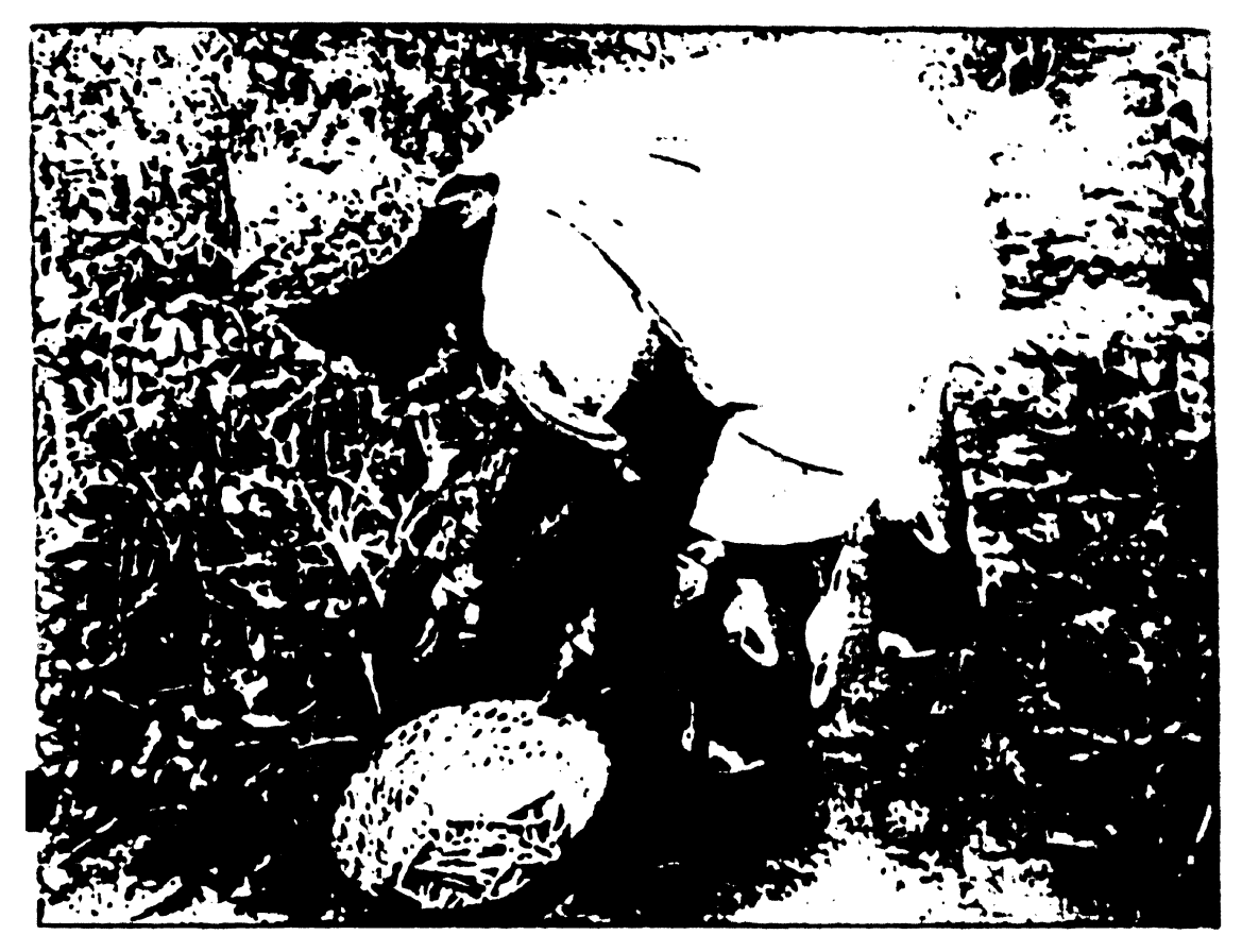
Cowpea experiments in Upper Volta.

fields received 4 times the amount of manure and 10 times the amount of plowing labour devoted to the average local white sorghum field. Also reflecting farmers' recognition of the responsiveness of E 35-1 to fertilizer, E 35-1 was sown more often on plots previously in fallow or sown to legumes than was the local.