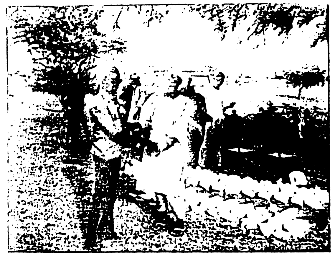
Distributing seed for sorghum thals under farmers' conditions.

The results nevertheless indicated that the adoption and management of E 35-1 corresponded remarkably closely to projections from level-5 tests. As had been predicted, early adoption was more common among farmers who had animal traction and, thus, added capacity to prepare the soil and added access to manure.