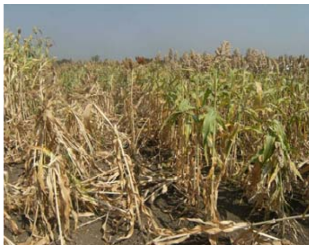
Figure 2. Expression of stay-green trait (in sorghum) under receding soil moisture conditions in a vertisol (photo courtesy: C Tom Hash, Santosh Deshpande and Vincent Vadez, ICRISAT).

Genetic enhancement of sorghum for drought tolerance would stabilize productivity and contribute to sustainability of production systems in drought-prone environments. The extent of grain yield losses due to drought stress depends on the stage of the crop and the timing, duration, and severity of drought stress. Sorghum responses to moisture stress at all four growth stages have been well characterized. Variation in these responses has been observed and found to be heritable [3]. Since the phenotypic responses of genotypes differing in drought tolerance can be masked if drought occurs at more than