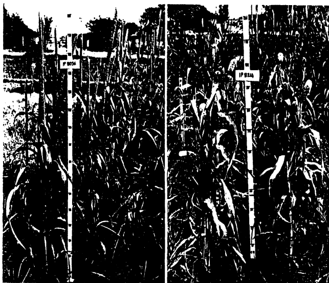
Figs. 1 and 2. Semi-dwarfs: 1 IP 8056 with very long spikes; 2 IP 8214 with very short globose spikes