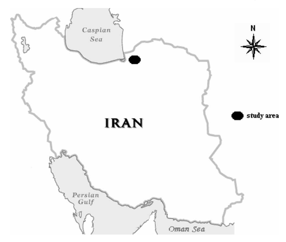
Figure 1. Location of the study site in northern Iran.

than 2% general slope. Generally, the soil texture is silty loam and silty clay loam in the 0–30 cm soil layer, and the soils of the study area are dominantly classified as Fine silty, mixed (calcareous), thermic, Typic Natrargids and Fine silty, mixed (calcareous), thermic, Typic Haplosalids according to Soil Taxonomy (Soil Survey Staff, 2006). The watertable depth with high salinity (EC around 13 dS/m) varies from 1.5 to 3 m within the field and its variability follows the microtopography changes.