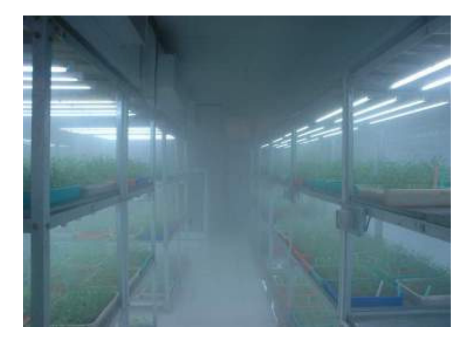
Fig. 1. Controlled environment plant growth room facility for Ascochyta blight screening at ICRISAT, Patancheru, India.