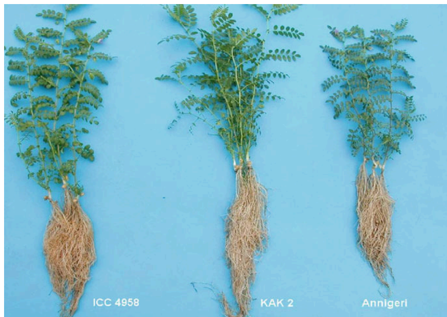
Fig. 10.1 Comparative root profiles in three chickpea genotypes. The figure shows 35-day-old plants of three chickpea genotypes, namely ICC 4958, KAK 2, and Annigeri. These plants were grown in pots in glasshouse conditions. It is evident from the figure that the root biomass for ICC 4958 is relatively higher than the other two chickpea genotypes. Higher root biomass confers high level of drought tolerance in ICC 4958 genotype.

drought tolerance. The genotype, ICC 4958, showed the best performance not only at ICRISAT field trials but also at several other locations in India and in the Mediterranean climate in Syria, which was found to possess higher root biomass (ICARDA 1989; Saxena et al. 1993; Krishnamurthy et al. 1996; Ali et al. 1999, 2005). Subsequently, field experiments at ICRISAT with 12 diverse chickpea germplasm including ICC 4958 showed that a prolific root system, especially in the 15–30 cm soil depth, had positive effects on seed yield under moderate terminal drought intensity, and a deeper root system to improved yield under severe terminal drought conditions (Kashiwagi et al. 2006). The large variation in root systems within such a small group of genotypes (Fig. 10.1), and the relation between root length density (RLD) and yield under drought, suggests that an extensive and systematic screening of the chickpea germplasm might offer a promising range of variation for RLD. Furthermore, the RLD was increased under more severe stress conditions, particularly in more tolerant genotypes, and the RLD at the deeper layer was related to yield under more severe drought stress. These data suggest that the dynamics of root growth under drought conditions might be a key factor in understanding the contribution of roots to drought tolerance.