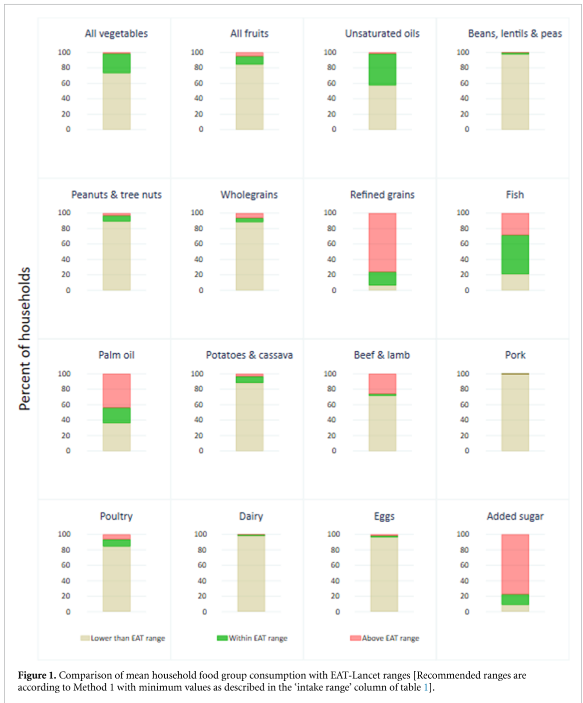
Figure 1. Comparison of mean household food group consumption with EAT-Lancet ranges [Recommended ranges are according to Method 1 with minimum values as described in the ‘intake range’ column of table 1].

[38], the diet does not fulfil nutritional requirements but consumption is often within recommended levels for food components known to impact heavily on the environment (such as livestock products) [21]. We also identified important socioeconomic characteristics that could serve as leverage points for improving healthiness whilst not impacting on the sustainability of diets in The Gambia.