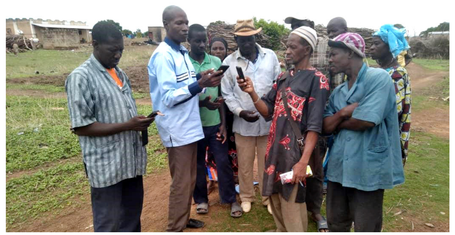
Registration process on the Sanji platform of Orange Malii.