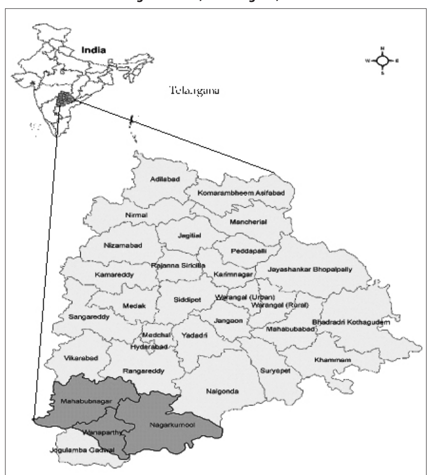
Figure 1. Location of surveyed districts (Mahabubnagar, Wanaparthy, and Nagarkurnool) in Telangana, India

of climate change and the variation to which a system is exposed, its sensitivity, and its adaptive capacity" (IPCC 2007, 27). Vulnerability is seen as a prerequisite for the development of appropriate adaptation strategies and policies. Vulnerability assessments have been used to investigate the complex set of interactions between humans and their socio-physical environments (Hahn, Riederer, and Foster 2009; Panthi et al. 2016; Adu et al. 2018). They capture both natural and socioeconomic processes that lead to vulnerability by measuring the appropriate variables at the appropriate scale, with a suitable conceptual framework. Context-specific measurements that account for the livelihood conditions of the target