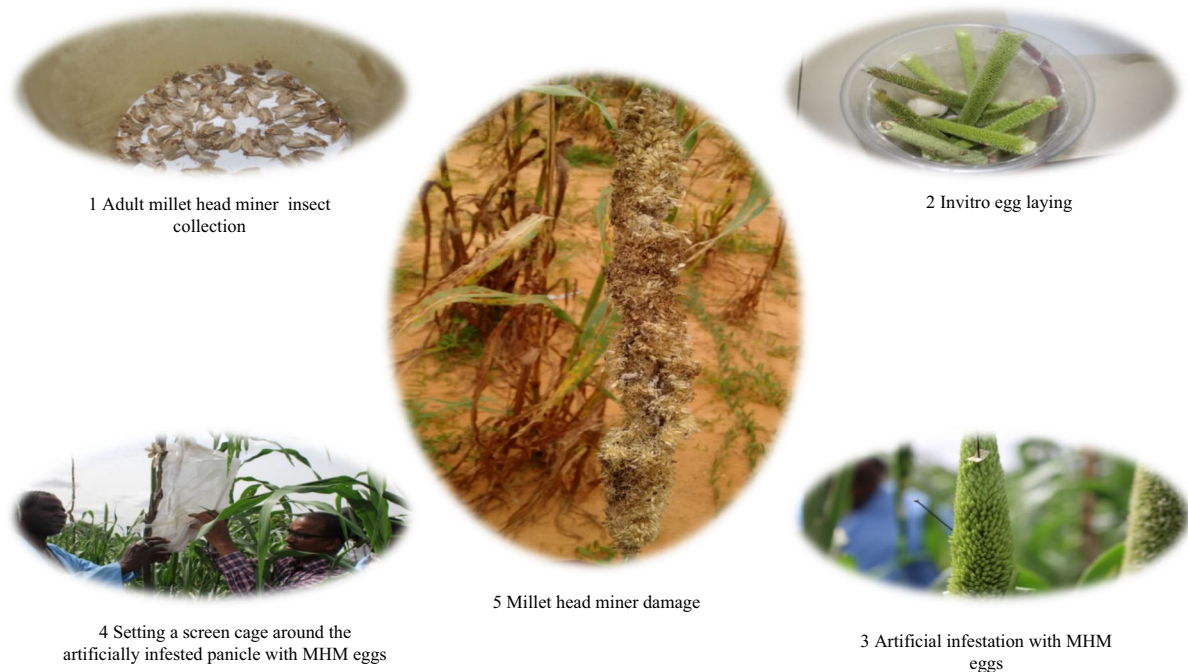
Fig. 1 Artificial screening of pearl millet genotypes using millet head miner (MHM) eggs under field conditions

flowering across seasons. Most of the genotypes performed well across seasons for plant height, panicle length, panicle circumference, and panicle compactness. Twelve genotypes exhibited stable performance for grain Fe and Zn contents across the seasons. The genotypes ICMV 177001, ICMV 177002, ICMV 177003, and Moro exhibited resistance to MHM and had consistent grain Fe content across seasons (ranging from 44 to 70 ppm). The genotypes ICMV IS 89305, ICMV IS 90309, Gamoji, ICMV 177001, ICMV 167005, ICMV 167014, ICMV IS 92222, SOSAT-C88, Souna 3, ICMV IS 94206, ICMV 167002, ICMV 177004, ICMV 147141, ICMV 147142, ICMV 147143, ICMV 147144 and PE00025 performed well for grain yield, across seasons.