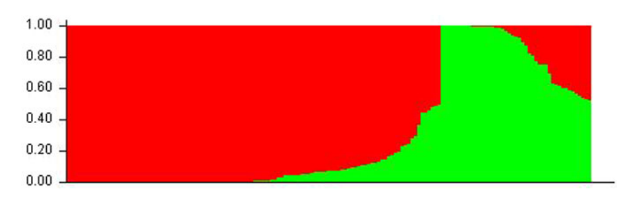
Fig. 3. Population structure of 157 sorghum accessions.

sorghum using a small set of highly polymorphic Simple Sequence Repeat (SSR) markers (Dje et al. , 1999, Uptmoor et al. , 2003, Ngugi and Onyango, 2012, Ramu et al. , 2013). However, the expected heterozygosity recorded in this study corroborate the reports of Ren et al.